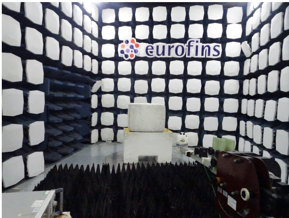
18GHz - 26.5GHz