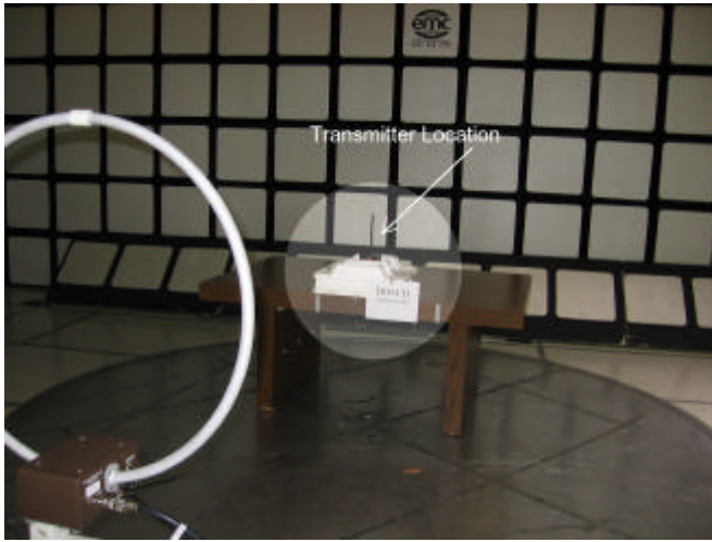
Radiated Emissions Transmitter Location X-Axis