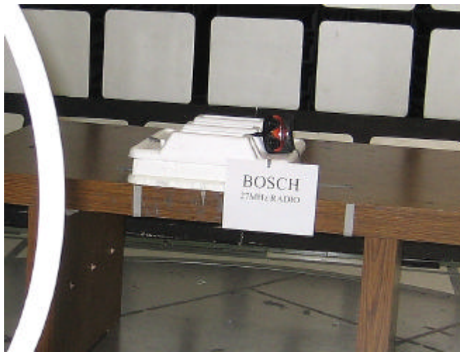
Radiated Emissions Y-Axis