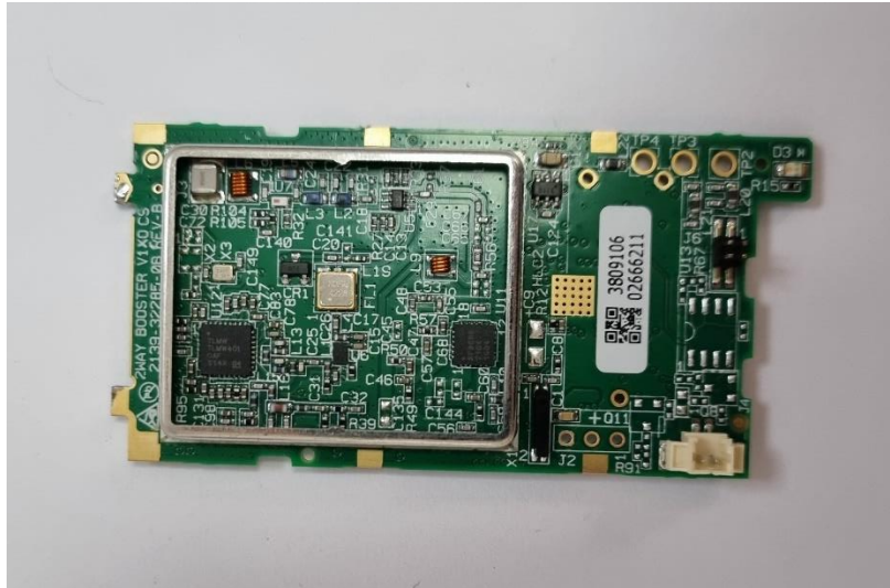
RF card - top view without shield