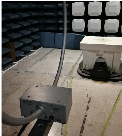
Figure 2: SAC Radiated Spurious Emissions (1 - 30 MHz) at 3m