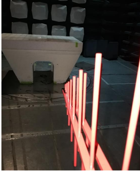
Figure 1: SAC Radiated Spurious Emissions (30 MHz – 1 GHz) at 3m