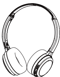
Philips Bluetooth headphones Philips TAH1108