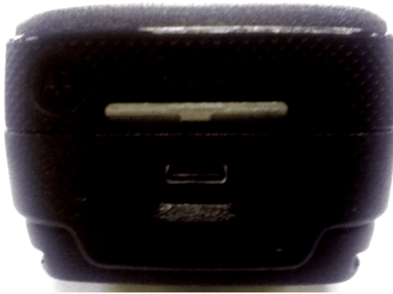
Bottom View with Battery for Limited Keypad and Non-Keypad Model