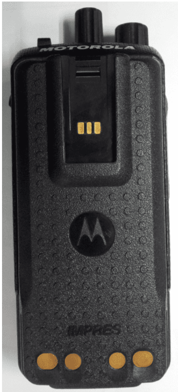
Back View with battery for Limited Keypad and Non-Keypad Model