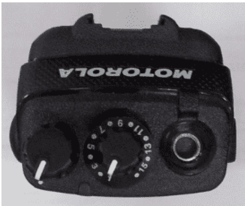
Top View for Limited Keypad and Non-Keypad Model (without Antenna)