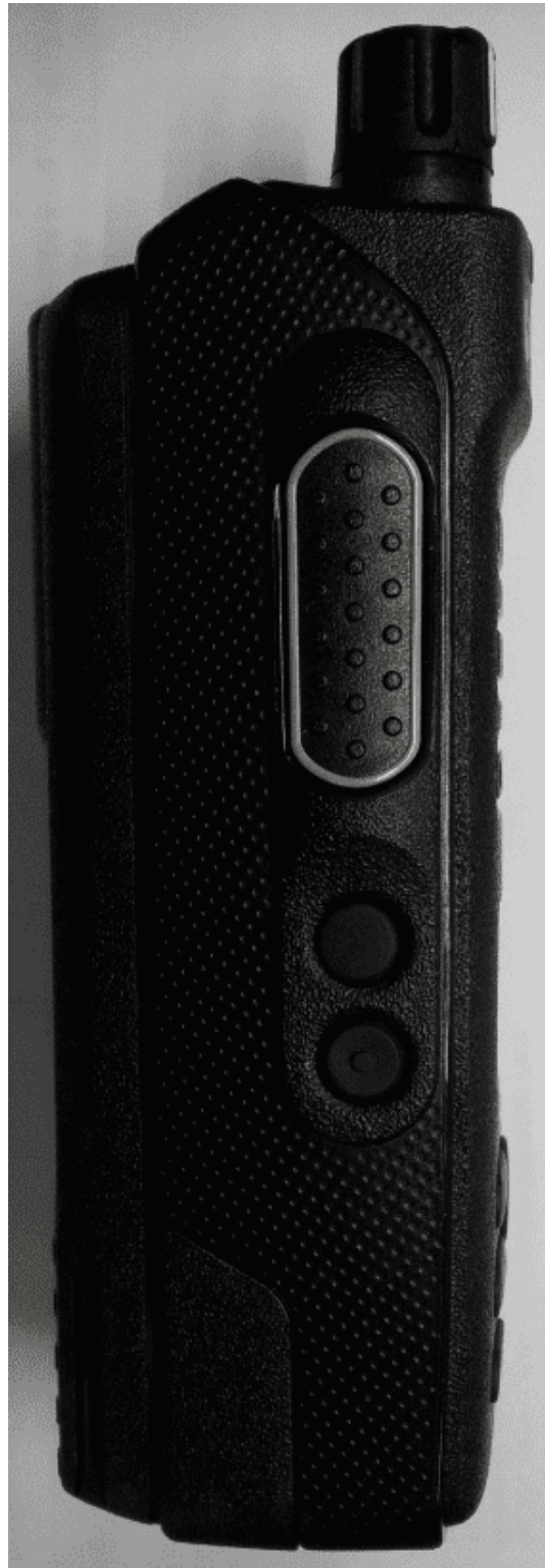
Side View (Left) for Limited Keypad and Non-Keypad Model