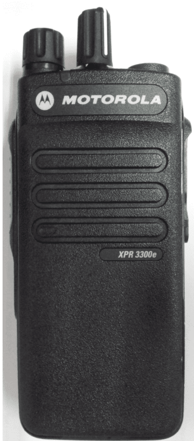
Front View of Non-Keypad Model (NKP)