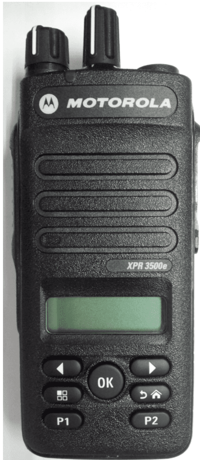
Front view of Limited Keypad Model (LKP)