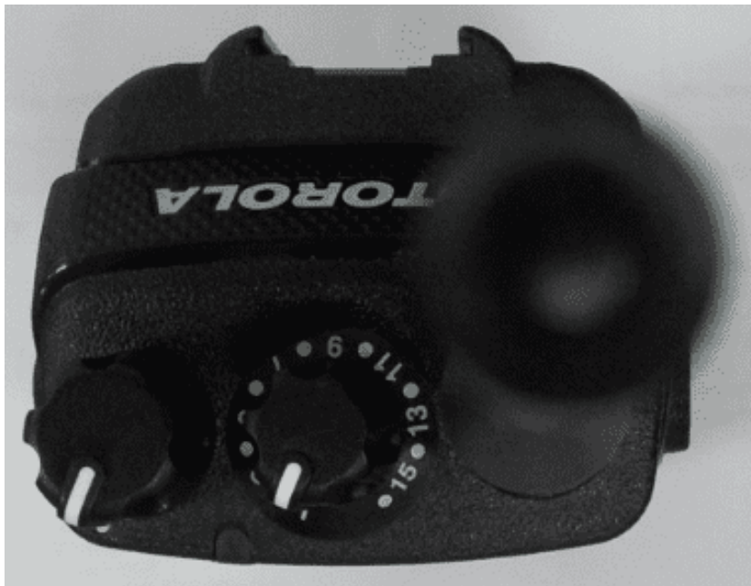
Top View for Limited Keypad and Non-Keypad Model (with Antenna)