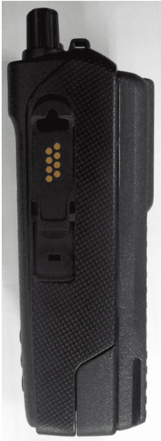
Side View (Right) for Limited Keypad and Non-Keypad Model