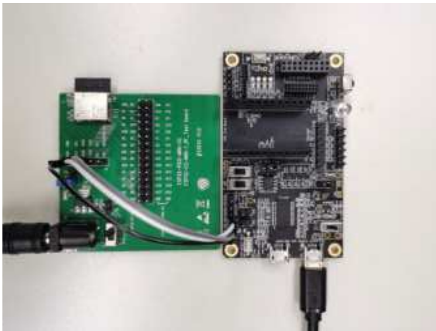
Figure 2: Hardware Connection