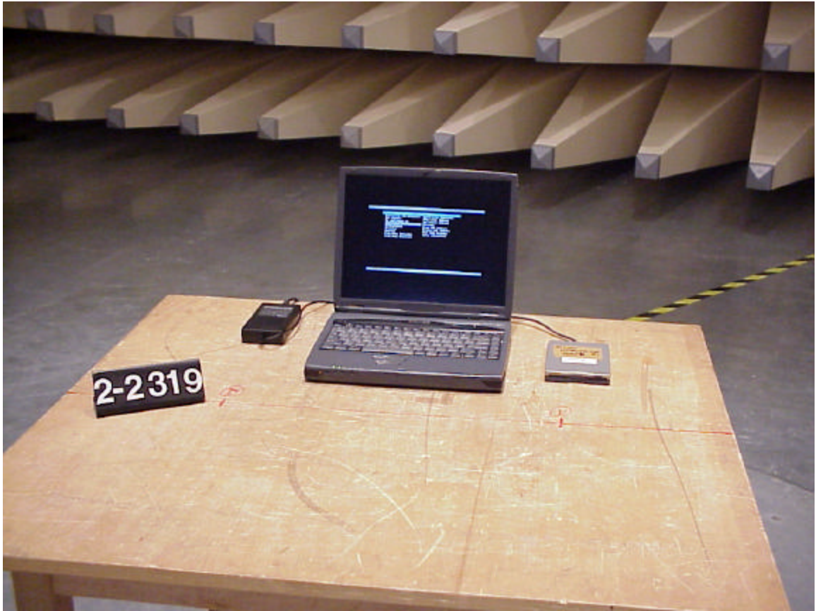
Front view of test setup