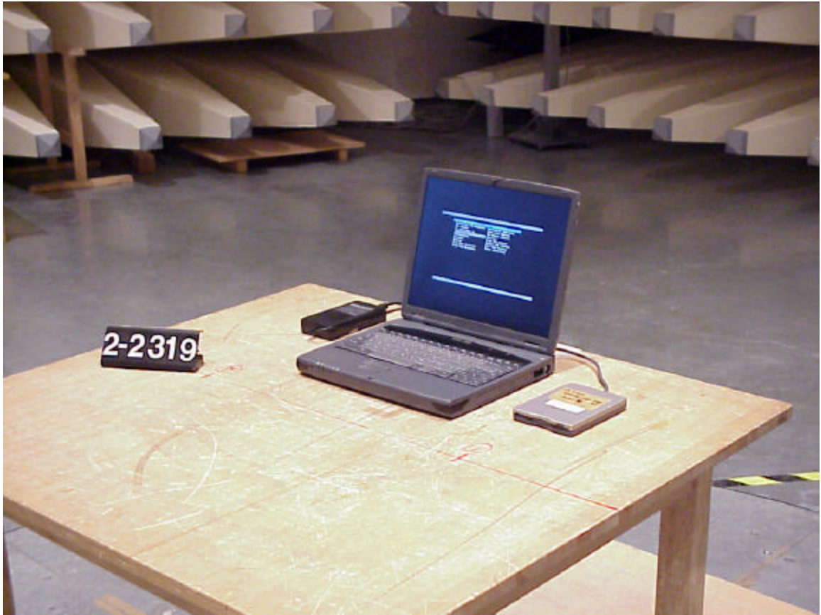
Side view of test setup