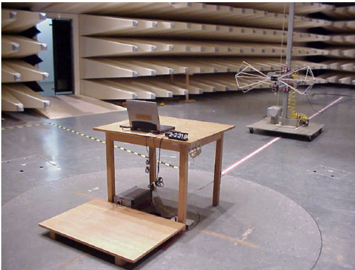
Back view of test setup