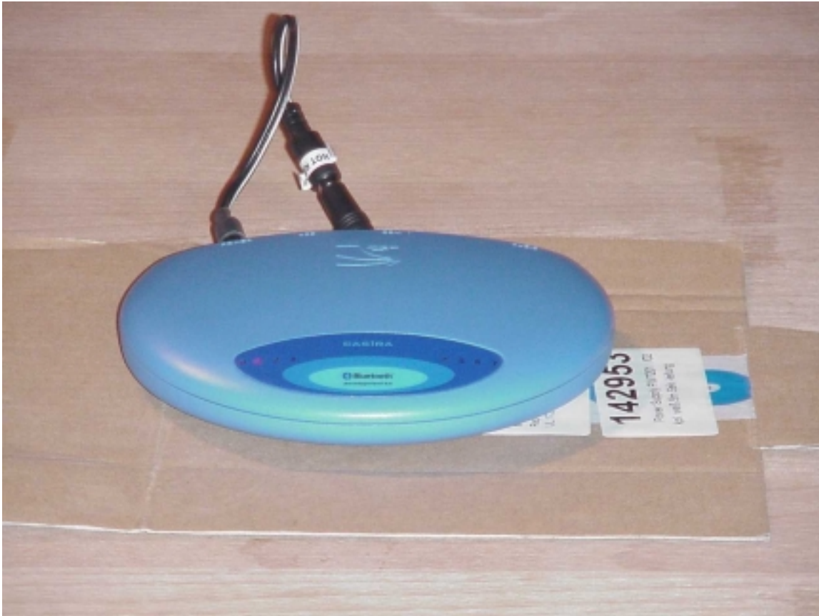
test box - front view