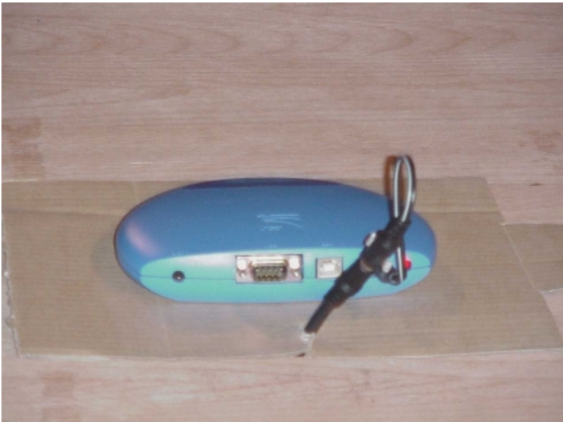
test box - rear view