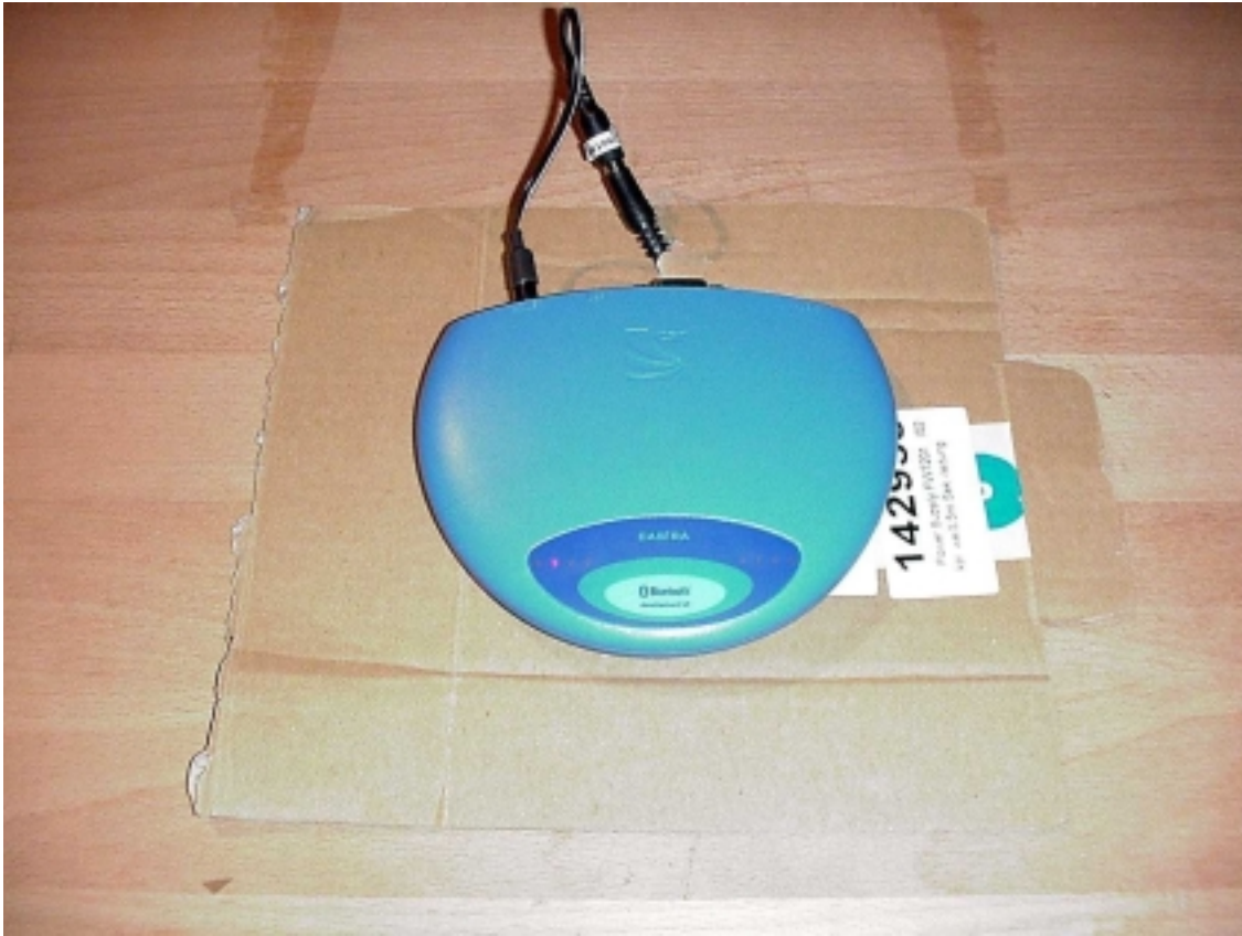
test box - top view