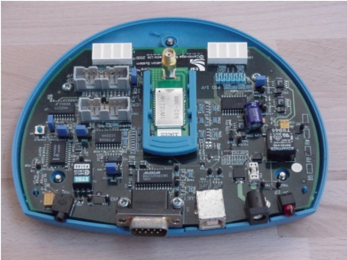
conducted sample inside of the test environment