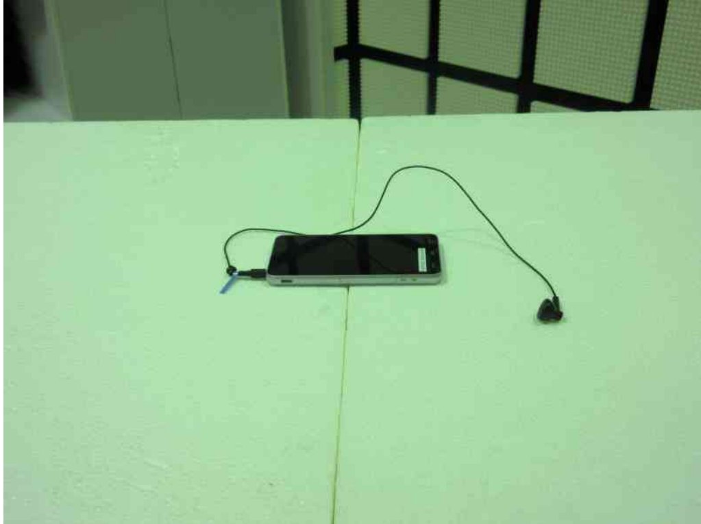
– X-axis –