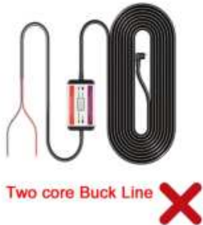
Two core Buck Line

The parking monitoring mode requires a three core step-down wire connection, and ordinary car chargers cannot trigger this function!