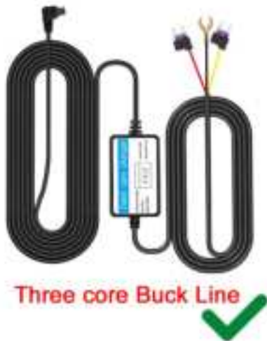
Three core Buck Line