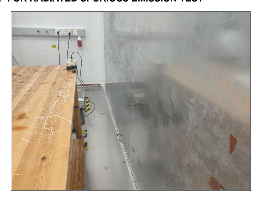
CONDUCTED EMISSION TEST