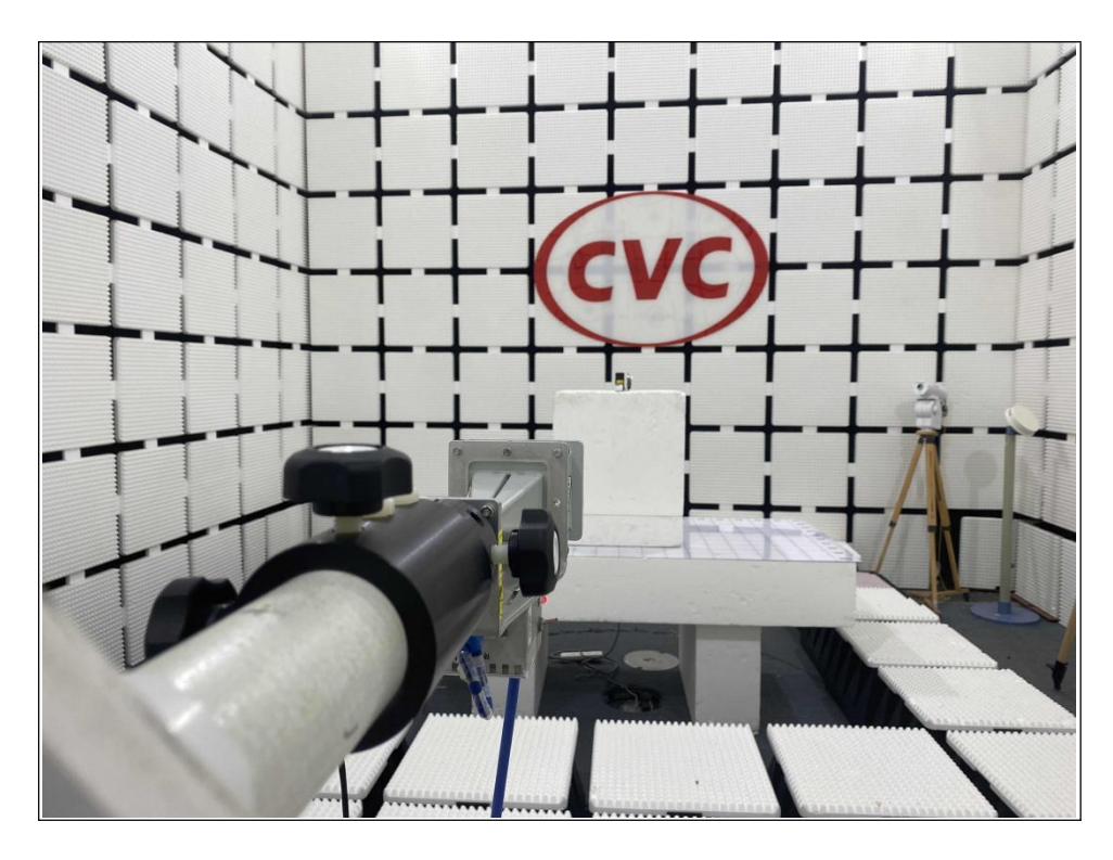
RADIATED EMISSION TEST (18GHz ~ 40GHz)