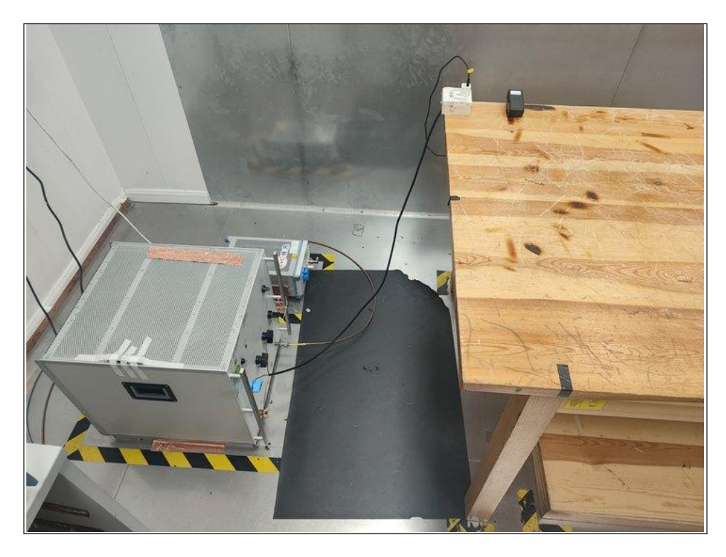
CONDUCTED EMISSION TEST