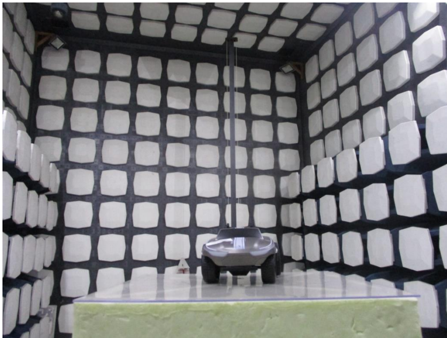
Back View (Above 1GHz)