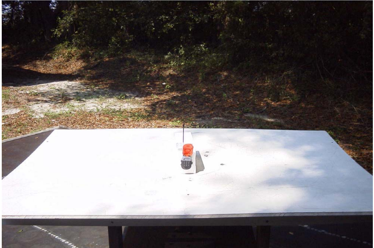
TEST SET UP PHOTO

APPLICANT: YICK SHUN ELECT. TOYS MFG. LTD