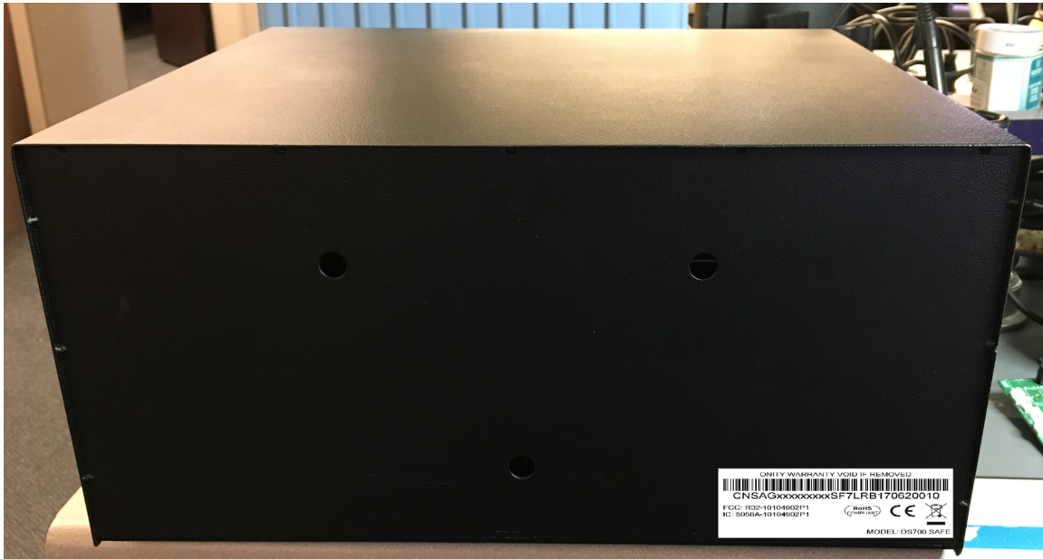
Figure 1. Location of labeling on the back side of the OS700 Safe.

This example approximates the placement of RF regulatory labeling on the OS700 Safe (see Fig. 1).