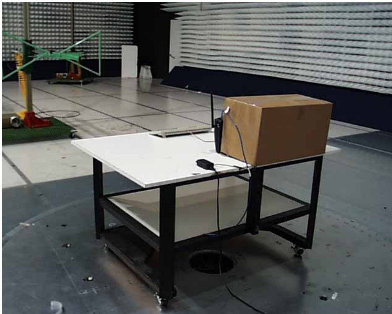
Figure 6: Radiated emissions, wall mount configuration, rear view