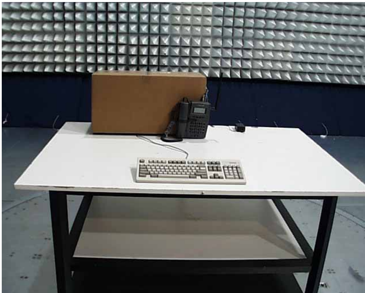
Figure 5: Radiated emissions, wall mount configuration, front view