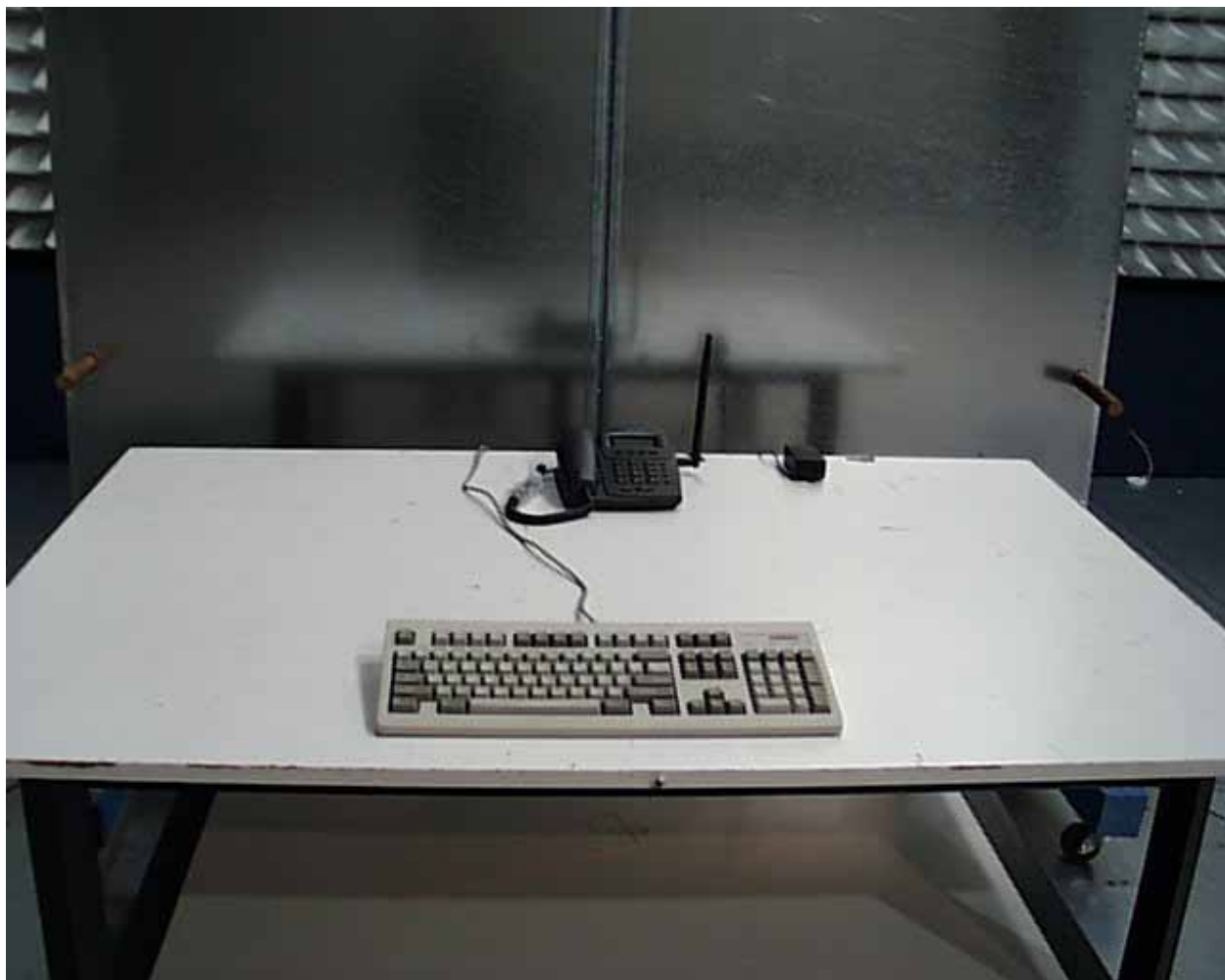
Figure 1: Conducted emission, front view