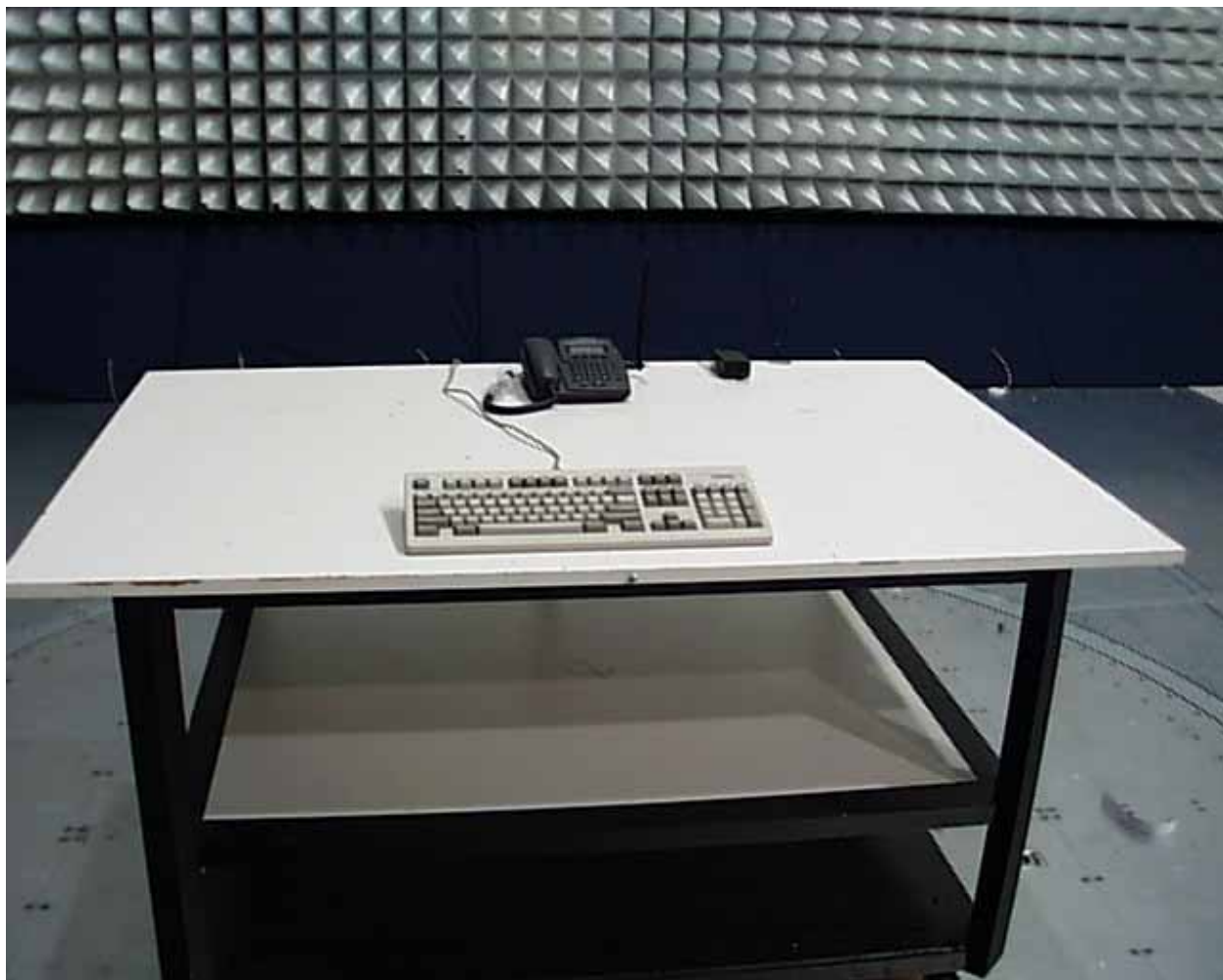
Figure 3: Radiated emissions, tabletop configuration, front view