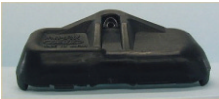
Right side view of Transmitter