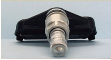
Rear view of Transmitter