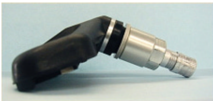
Left side view of Transmitter