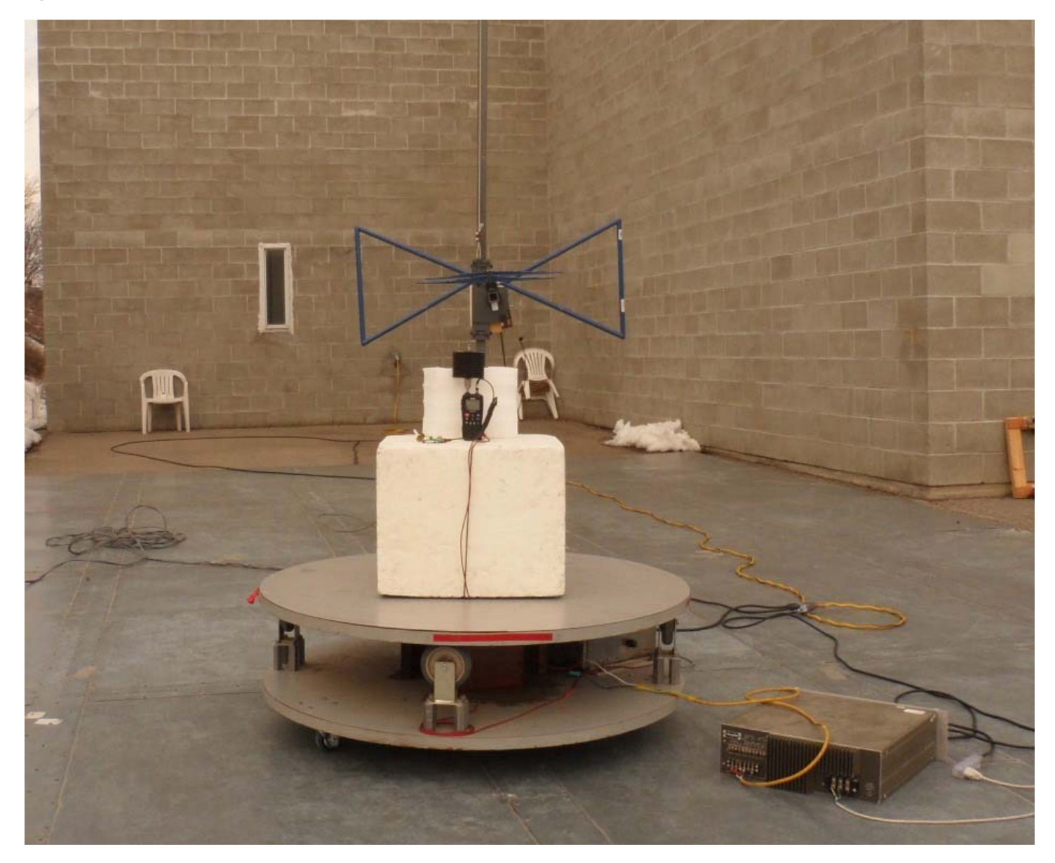
Figure E21.5 – Setup Photo – Radiated Measurements - Horizontal