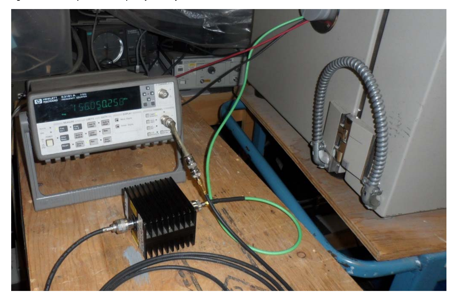
Figure E21.3 – Setup Photo – Frequency Stability Measurements