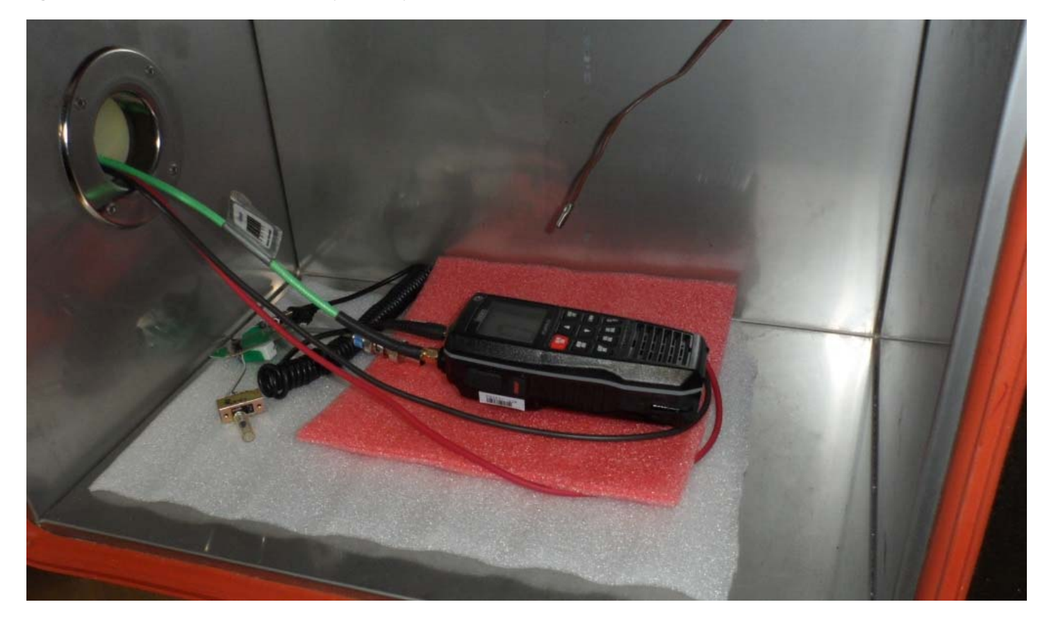
Figure E21.4 – Setup Photo – Frequency Stability Measurements