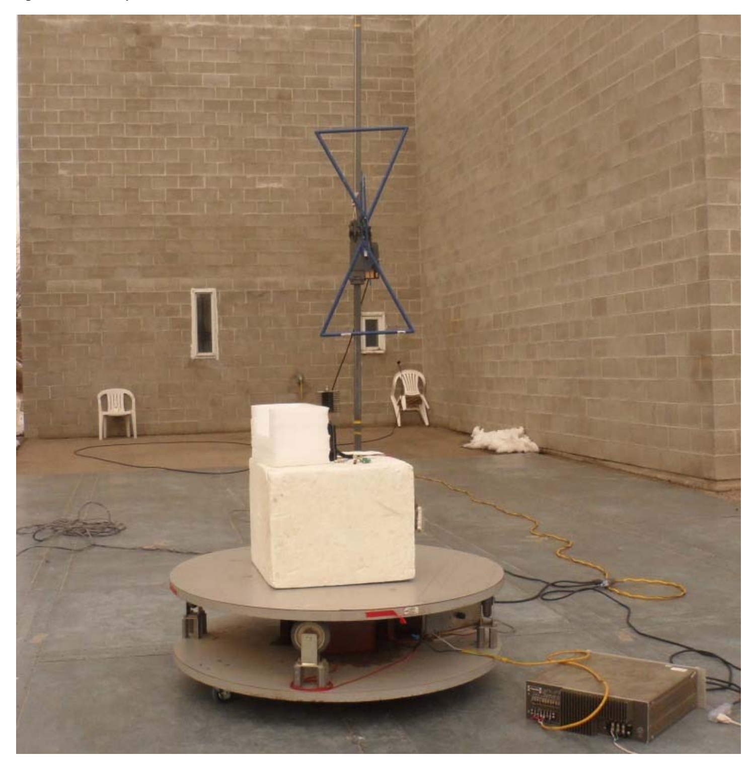
Figure E21.6 – Setup Photo – Radiated Measurements - Vertical