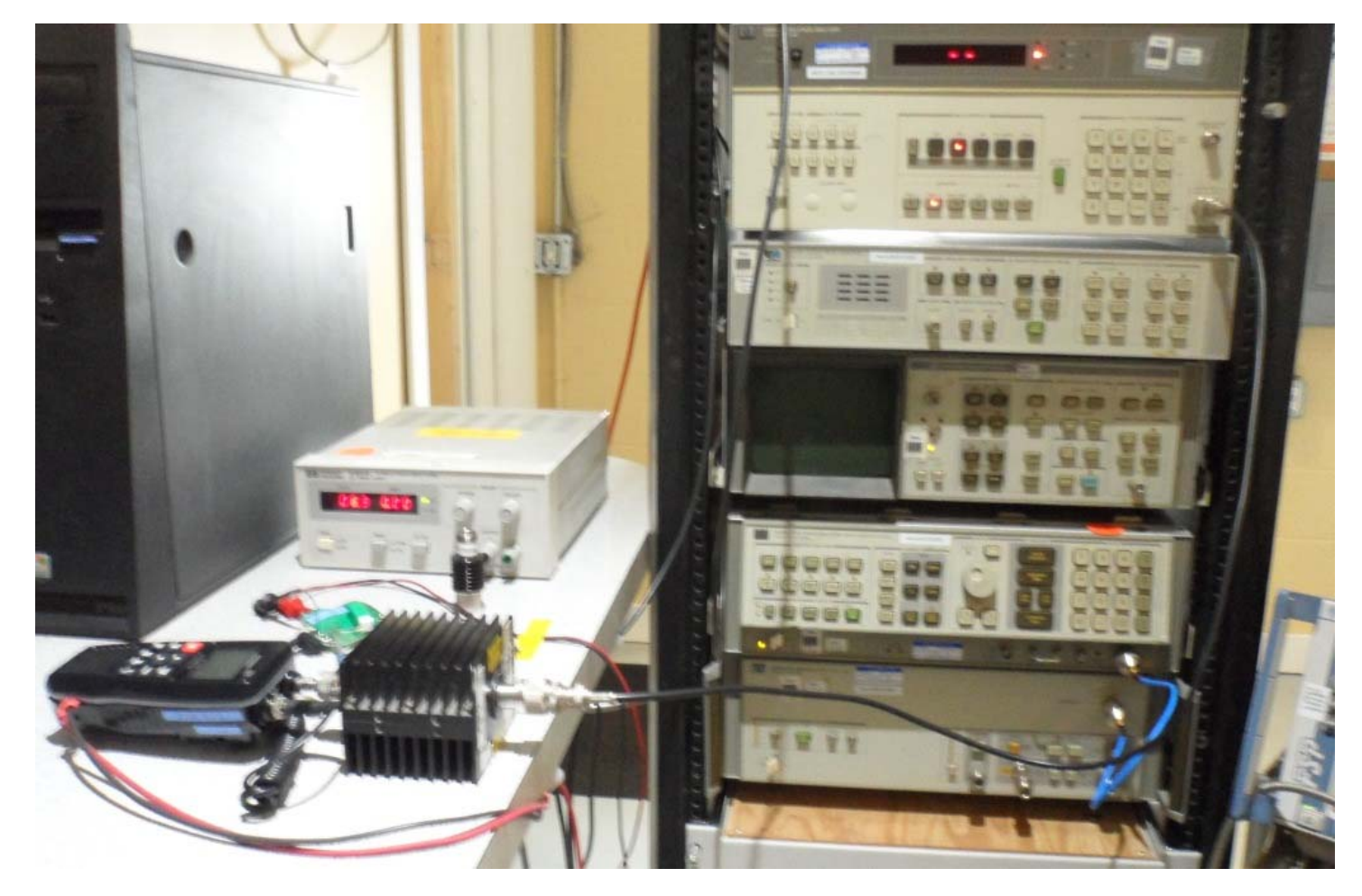
Figure E21.2 – Setup Photo – Audio Response Measurements