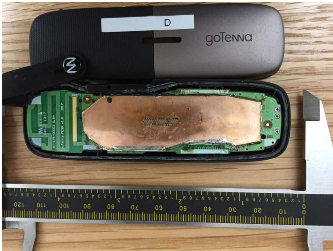
03 New PCBA with Shield and in Housing Top View