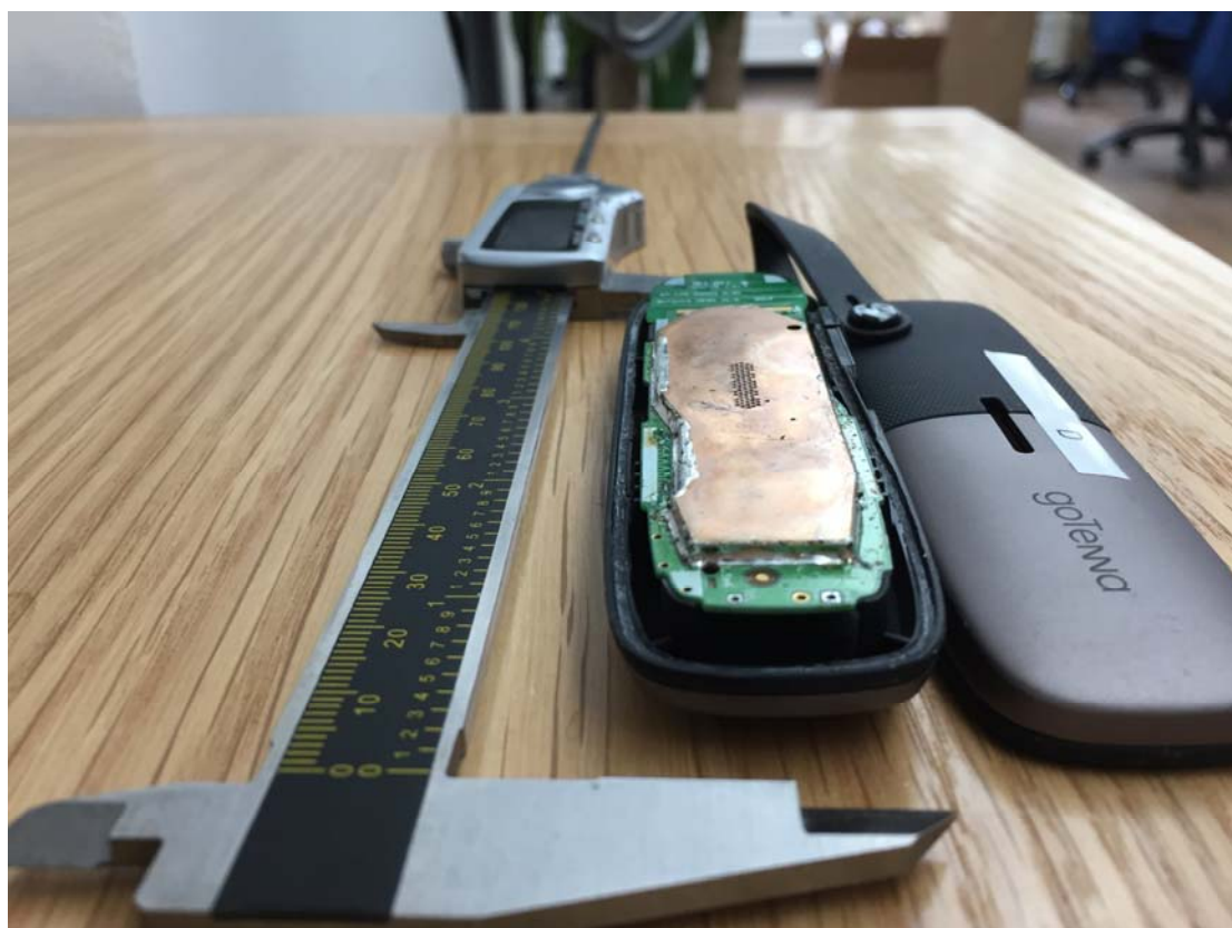
04 New PCBA with Shield and in Housing Side View