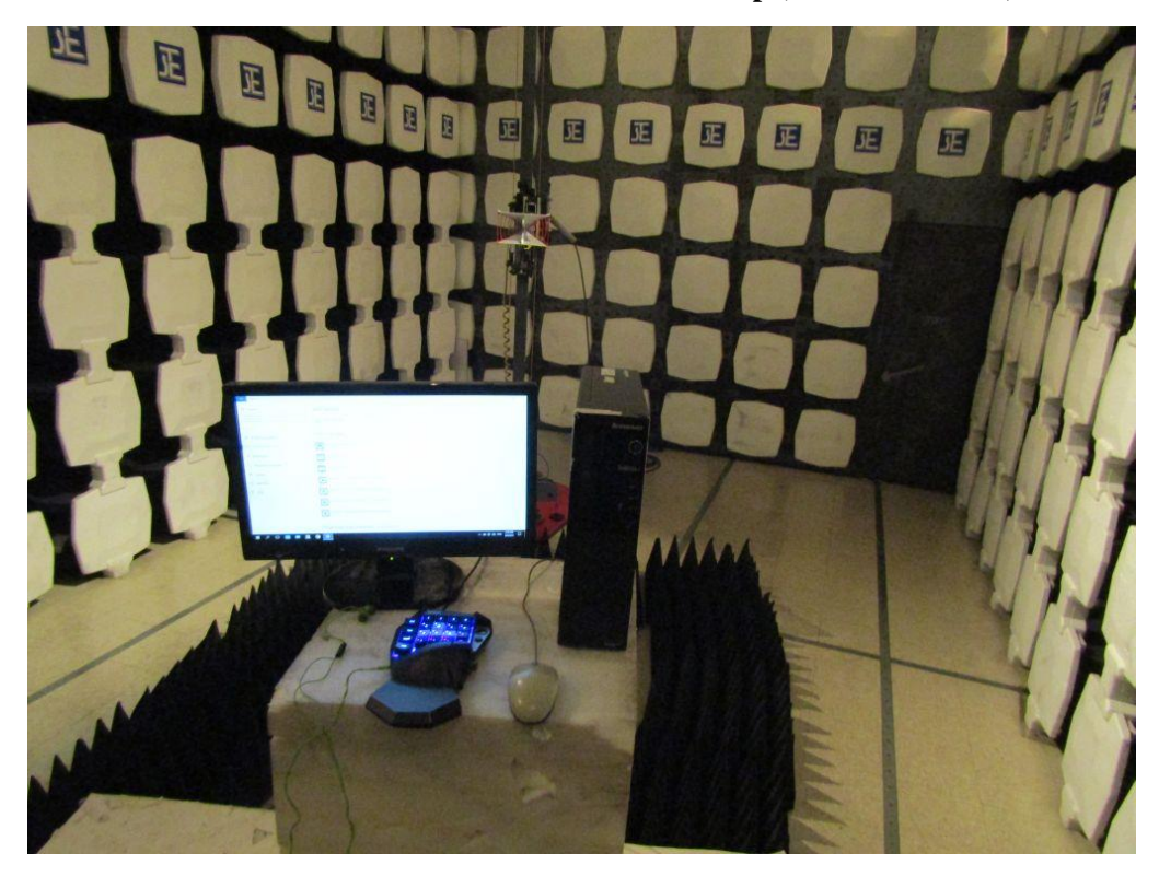
Measurement of Conducted Emission Test Set Up