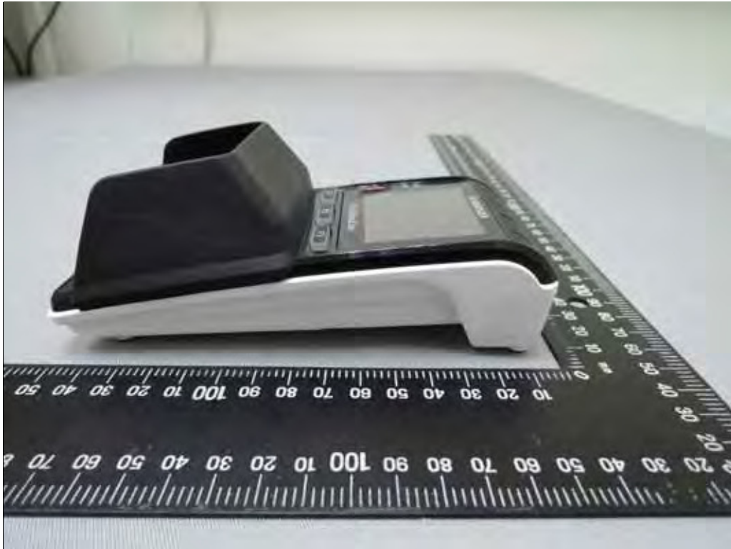
Side View of EUT – 3