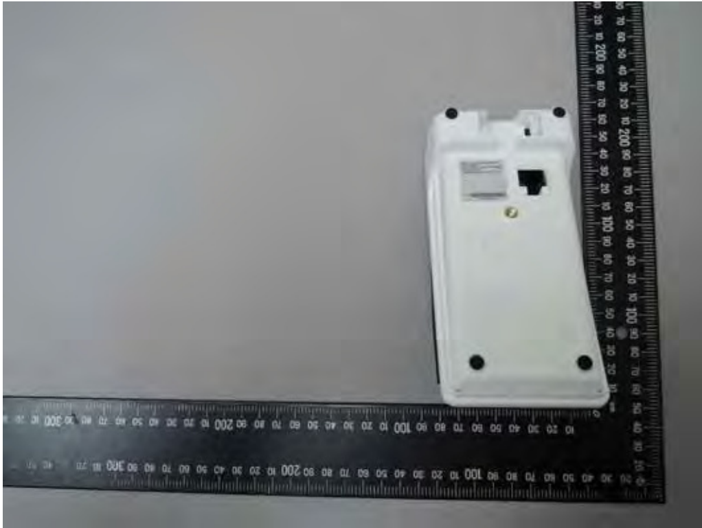
Side View of EUT – 1