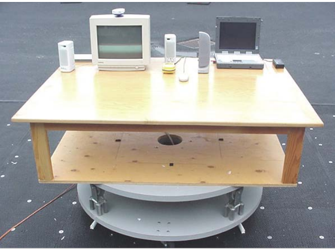
Photograph E-3 - Front of Radiated Emission Configuration