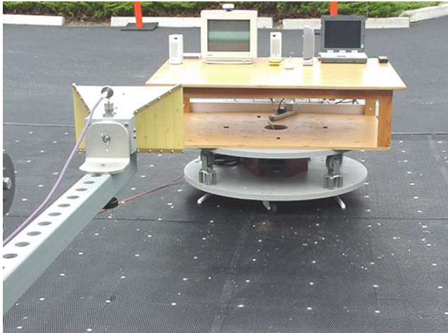
Photograph D-1 - Vertical Polarization (1-18 GHz)