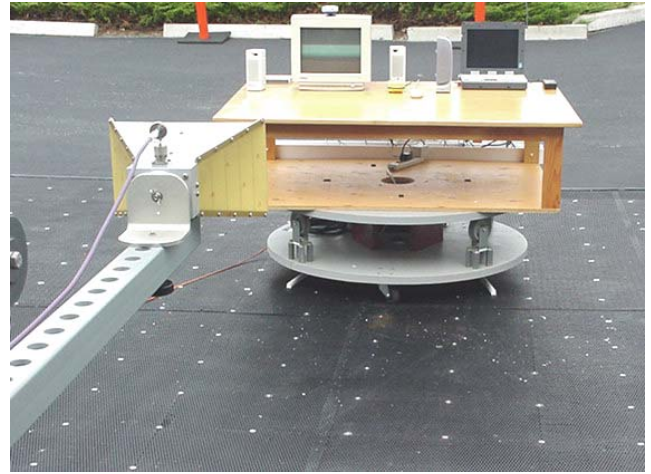
Photograph E-2 - Vertical Polarization (1-18 GHz)