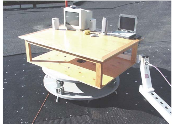
Photograph D-2 - Vertical Polarization (18-26 GHz)