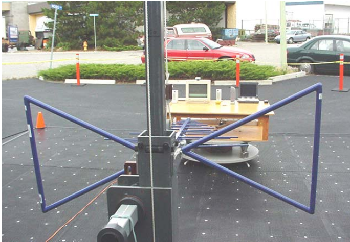
Photograph E-1 - Horizontal Polarization (30MHz - 1GHz)