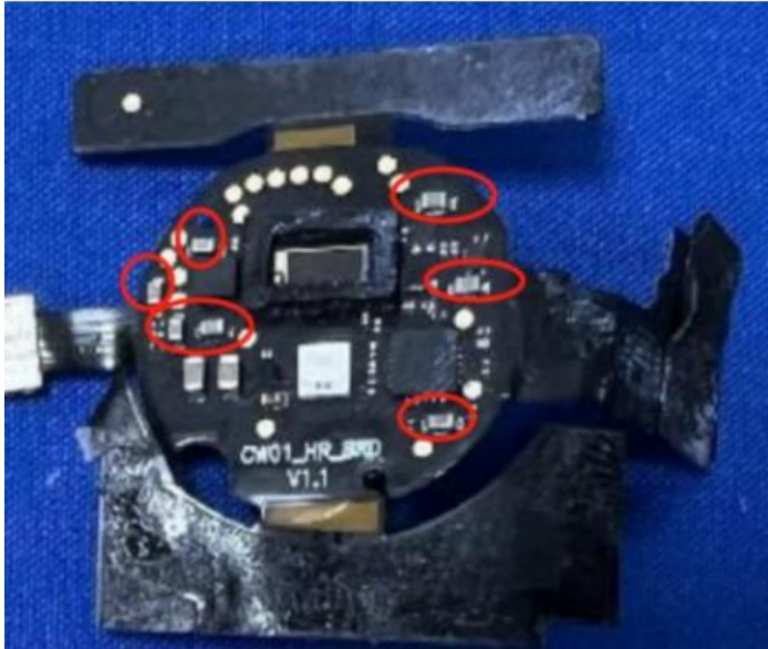
CW Watch S1变更前心率板 CW Watch S1 Pre-Modification Heart Rate Board