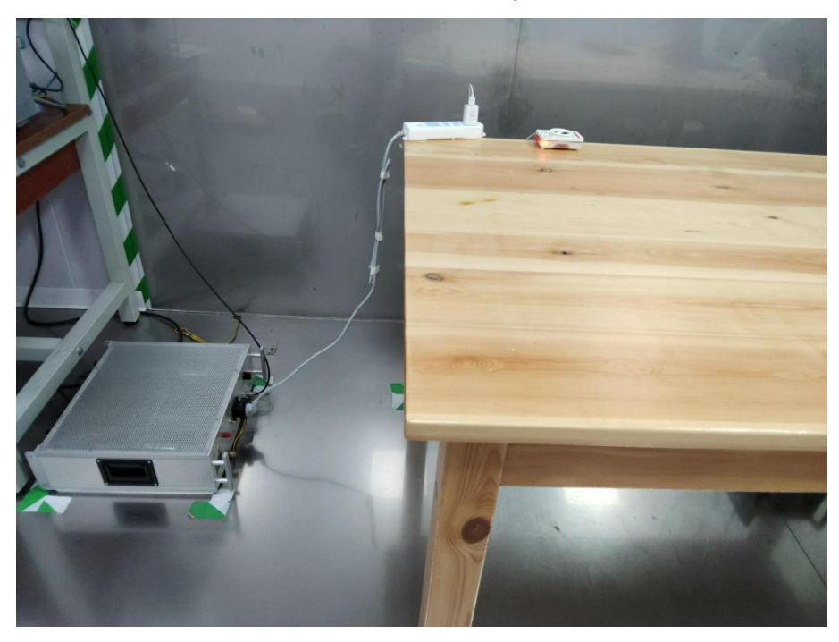
Radiated Spurious Emission (below 1GHz)