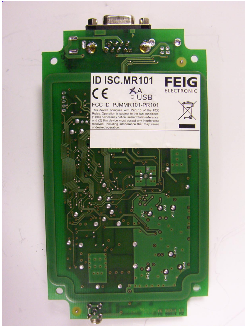
Transmitter PCB bottom