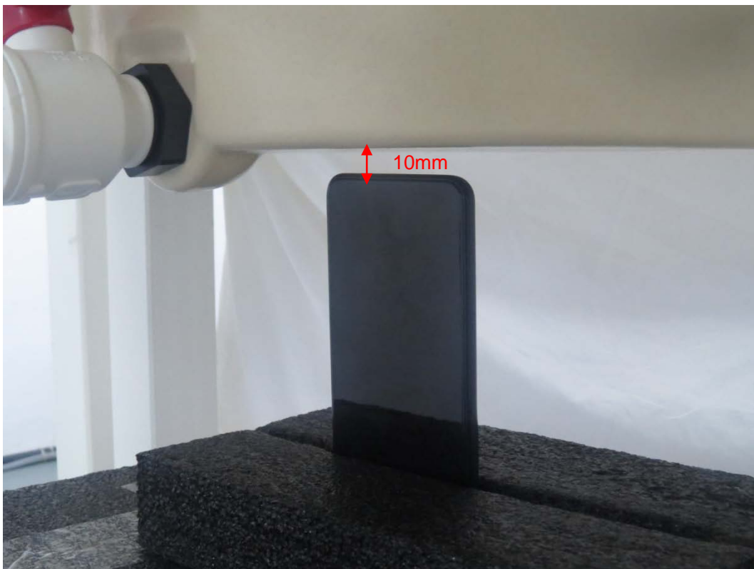
Picture 12: Bottom Edge, the distance from handset to the bottom of the Phantom is 10mm