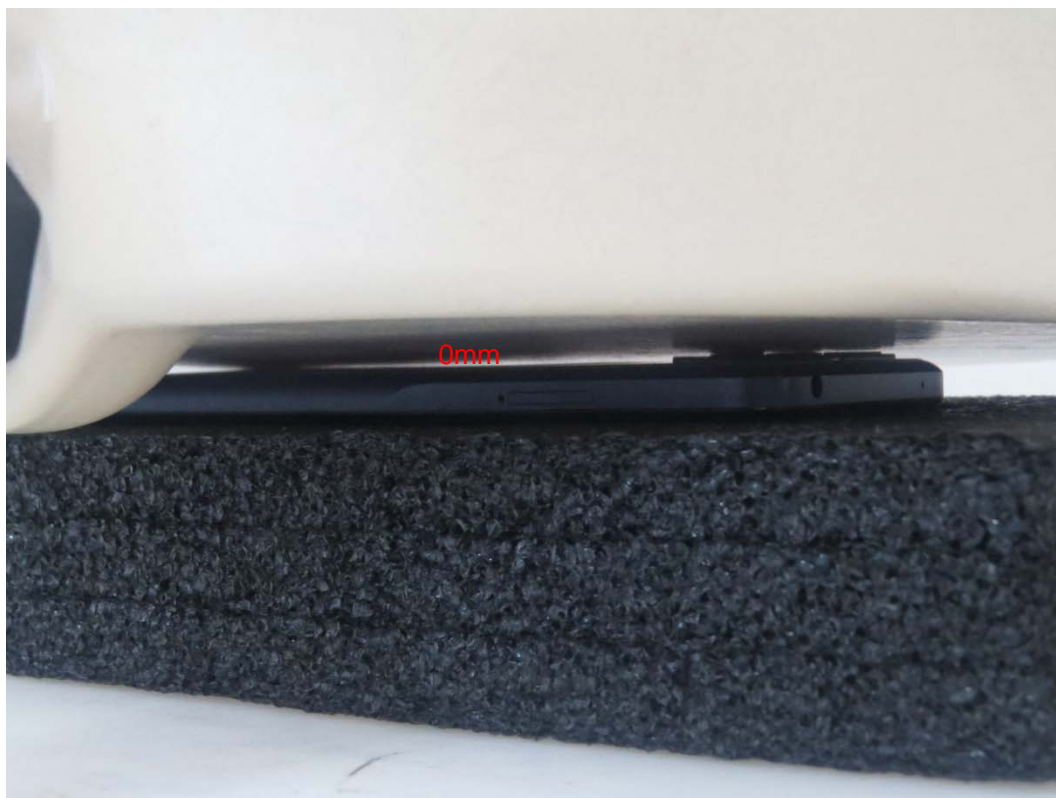
Picture 13: Back Side, the distance from handset to the bottom of the Phantom is 0mm