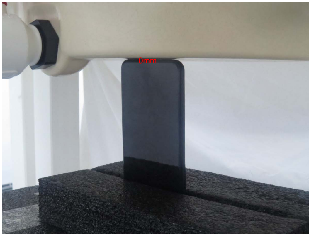
Picture 15: Bottom Edge, the distance from handset to the bottom of the Phantom is 0mm