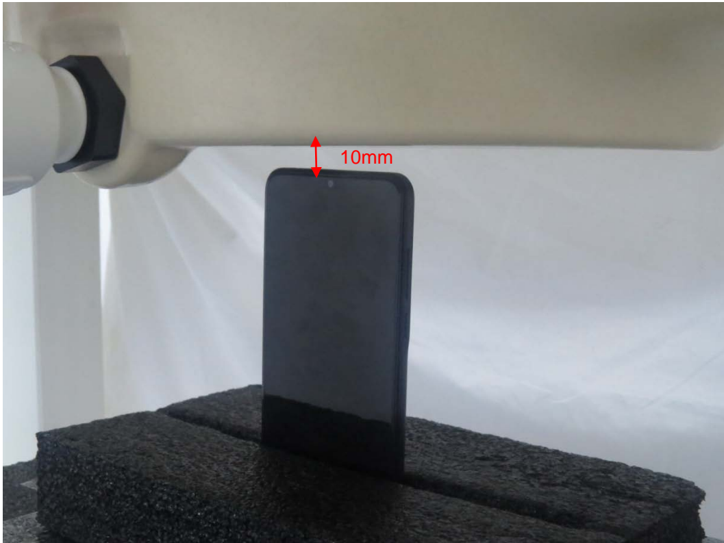
Picture 11: Top Edge, the distance from handset to the bottom of the Phantom is 10mm