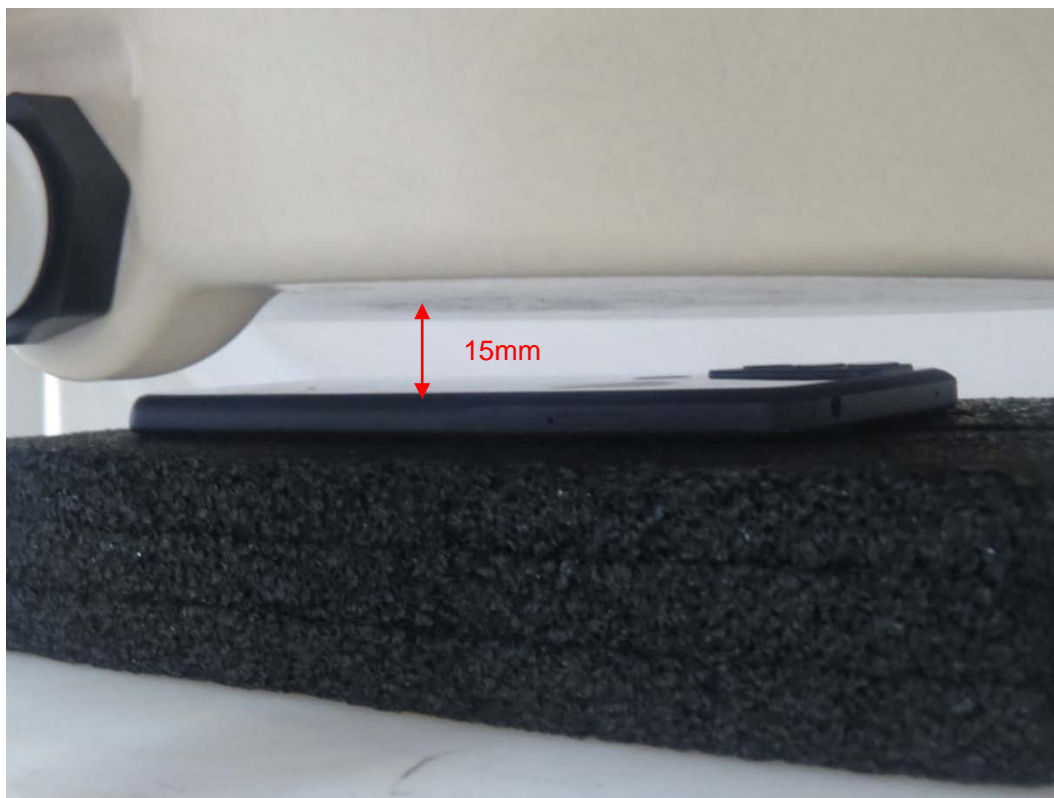
Picture 5: Back Side, the distance from handset to the bottom of the Phantom is 15mm