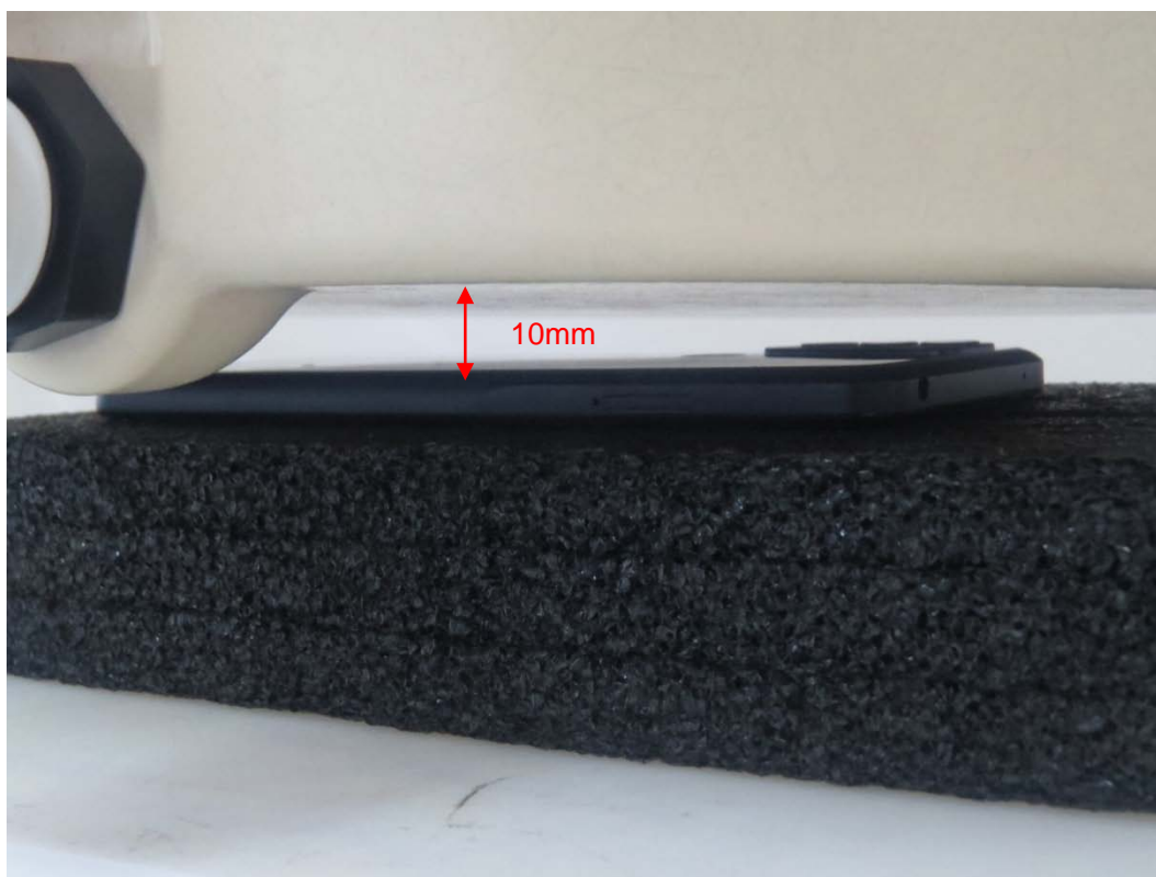
Picture 7: Back Side, the distance from handset to the bottom of the Phantom is 10mm