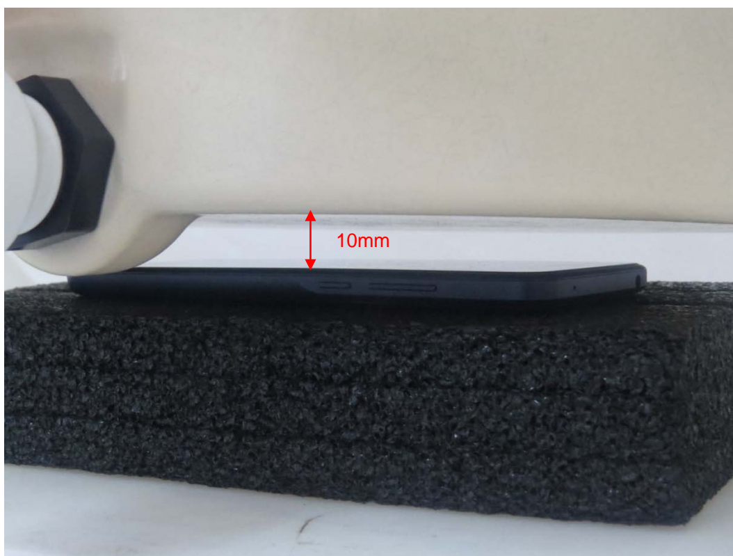
Picture 8: Front Side, the distance from handset to the bottom of the Phantom is 10mm