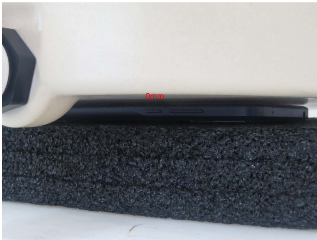
Picture 14: Front Side, the distance from handset to the bottom of the Phantom is 0mm