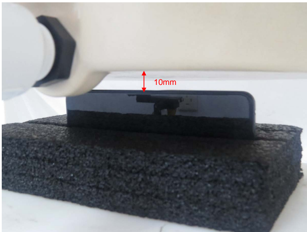
Picture 9: Left Edge, the distance from handset to the bottom of the Phantom is 10mm