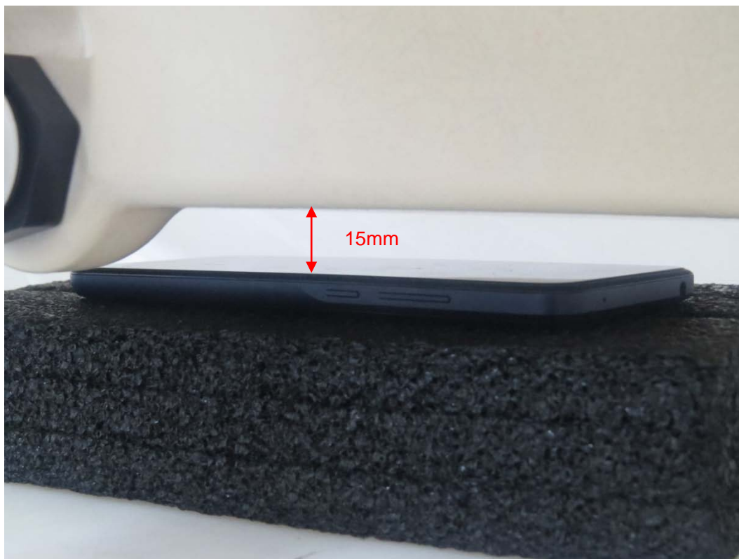
Picture 6: Front Side, the distance from handset to the bottom of the Phantom is 15mm