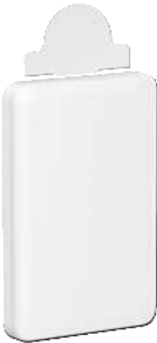
Figure 1: Appearance overview of N1 stamp

In addition, the N1 Stamp product supports extended temperature sensor, which can be applied to the environment temperature monitoring scenarios such as fresh fruits and offices.