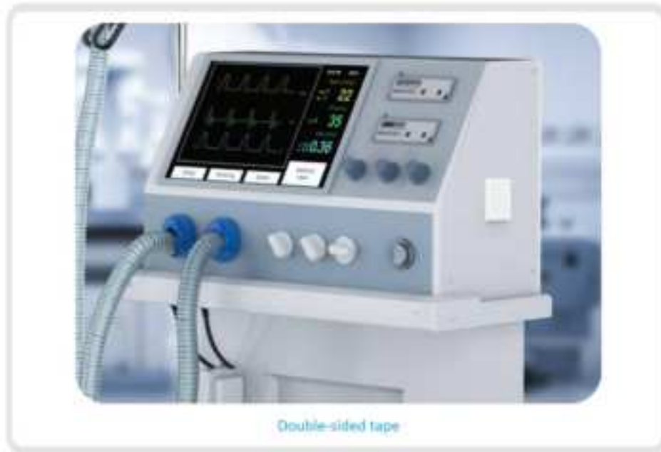
Figure 2: How to wear/install N1?