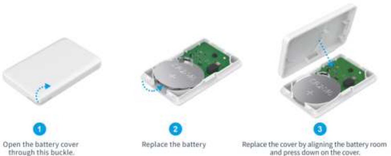
Figure 3: How to replace the battery of N1?