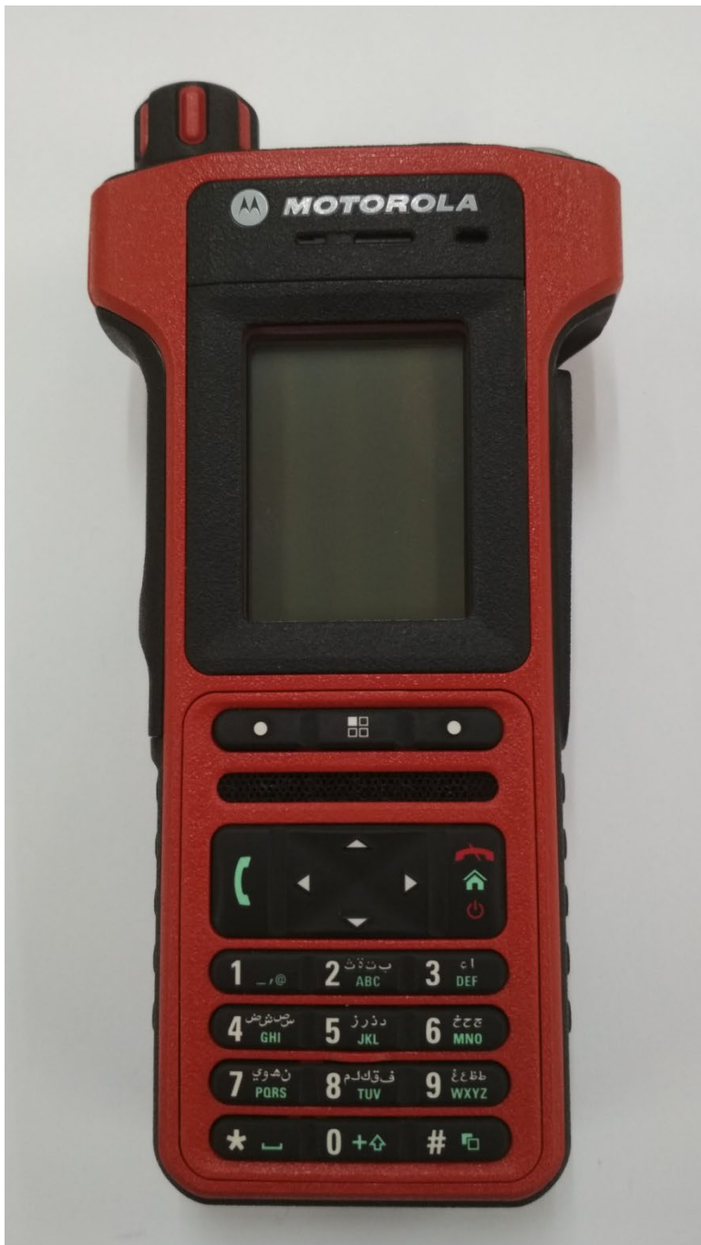
Front view with display and full keypad model, Model MTP8550Ex