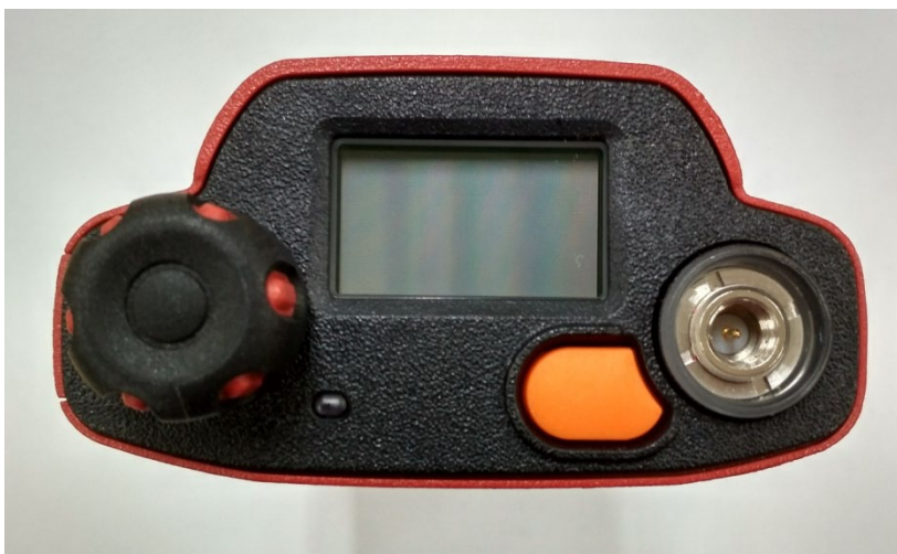
Top View (without Antenna), Model MTP8550Ex / MTP8500Ex