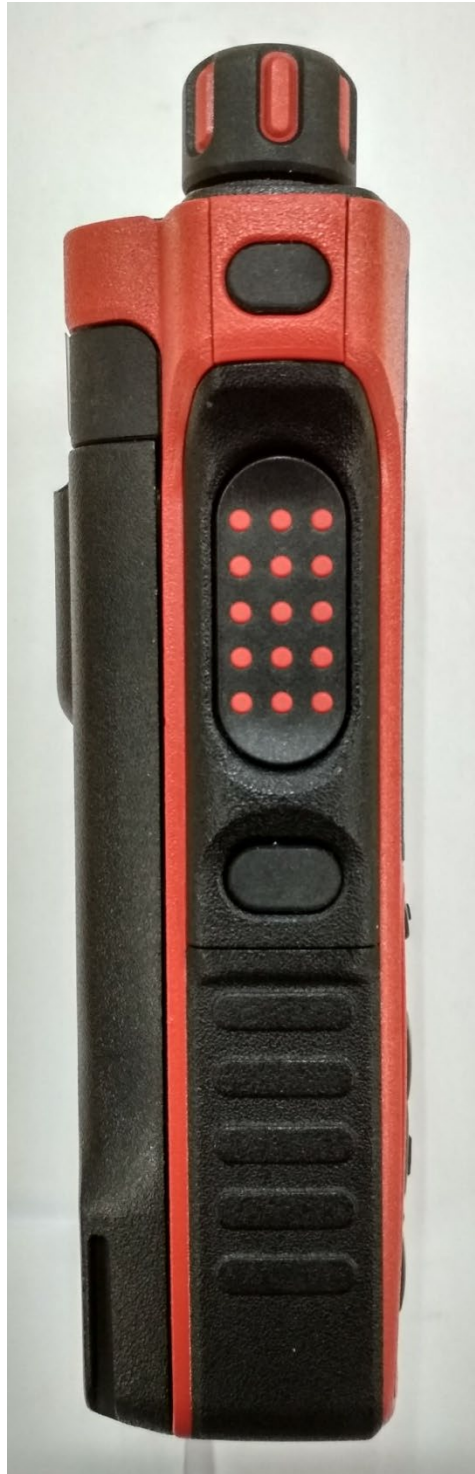
Side View (Left), Model MTP8550Ex / MTP8500Ex