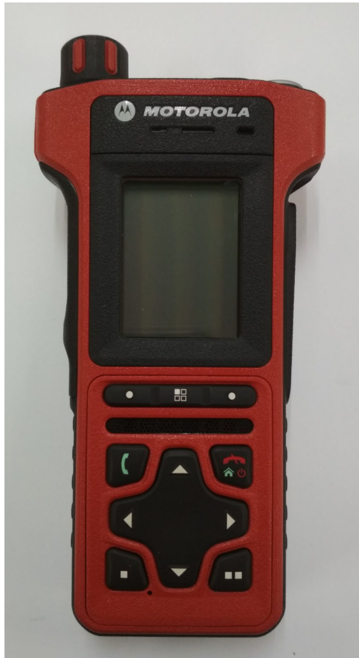
Front view with display and limited keypad model, Model MTP8500Ex