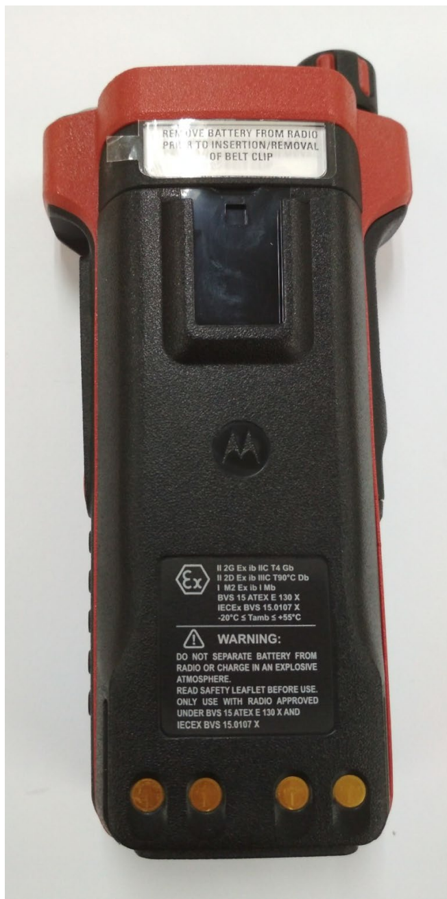
Back View with Battery, Model MTP8550Ex / MTP8500Ex