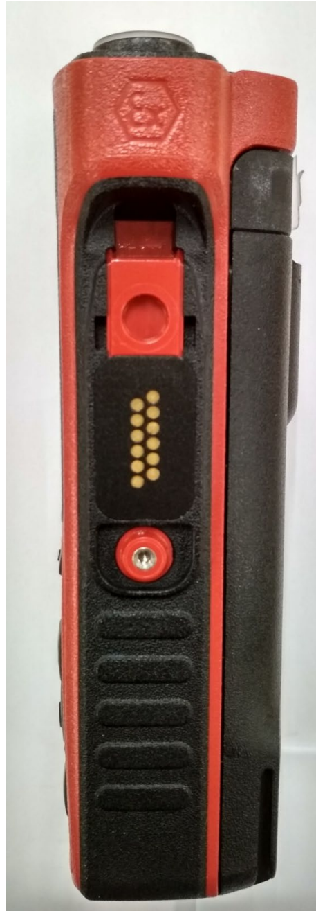
Side View (Right), Model MTP8550Ex / MTP8500Ex