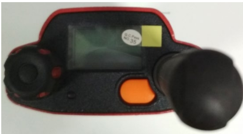
Top View (with Antenna), Model MTP8550Ex / MTP8500Ex