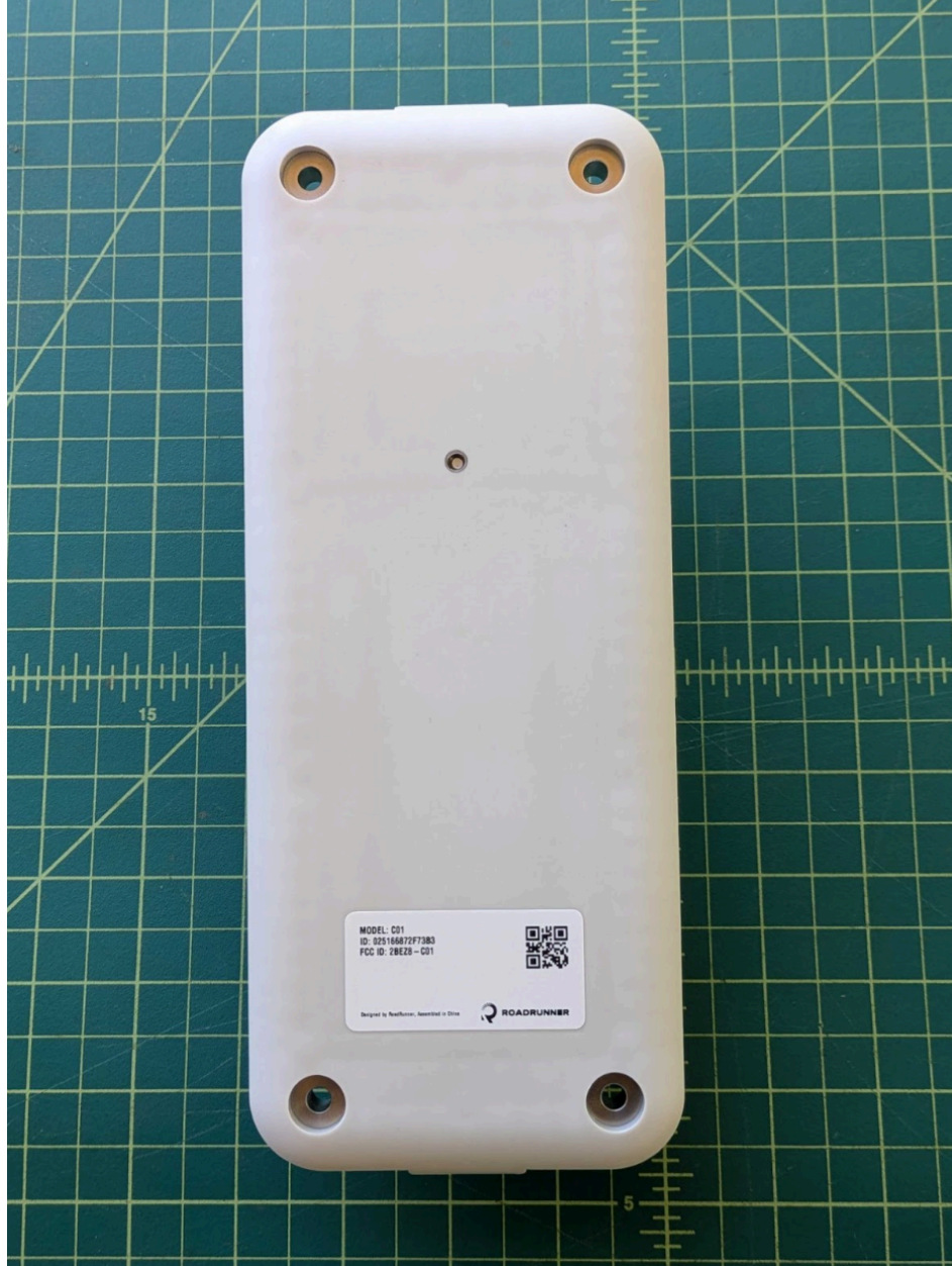
Figure 2. Picture of C01 with label visible on back side