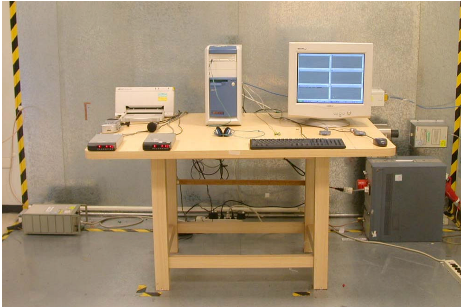
The Front View of Highest Conducted Set-up For EUT