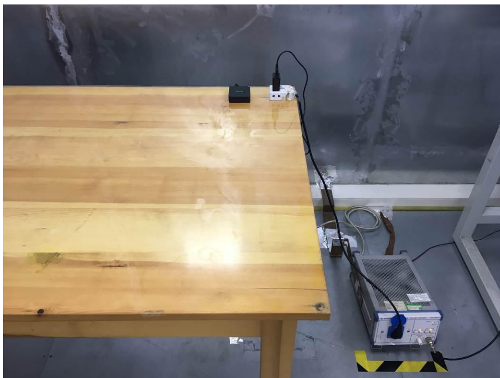
Power Line Conducted Emission