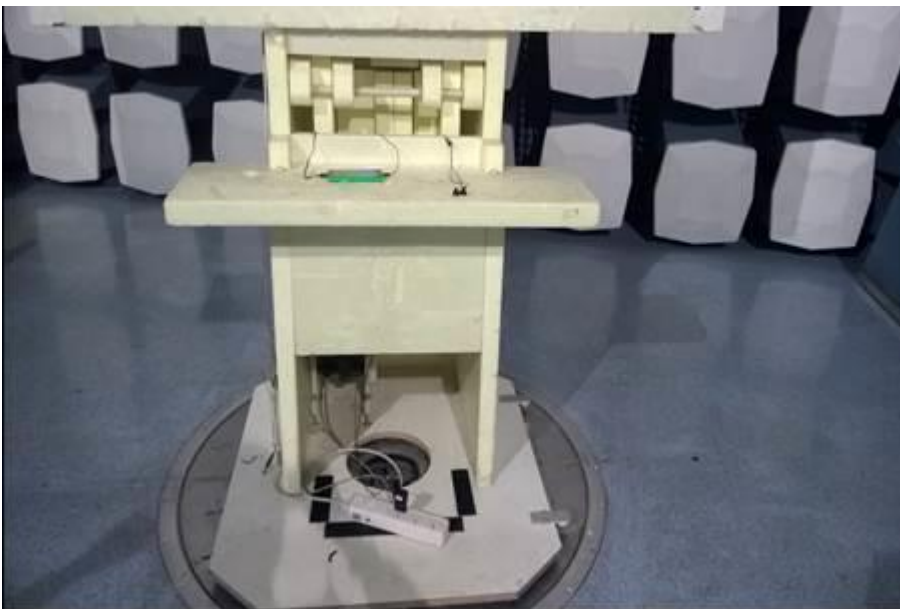
Picture 2. FCC Part 15B Radiated emissions