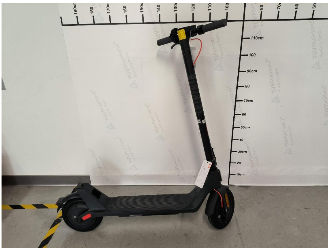
Pic. 1: Overview of DDHBC08LQ