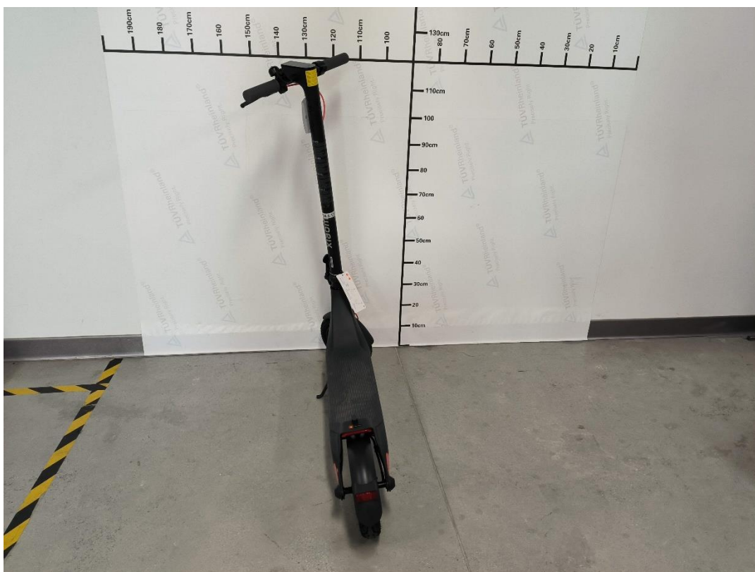
Pic. 2: Overview of DDHBC08LQ