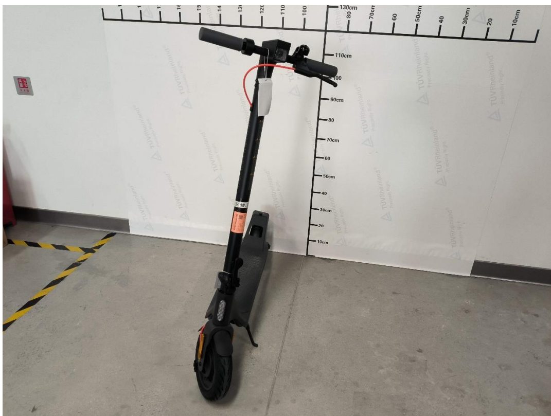
Pic. 4: Overview of DDHBC08LQ