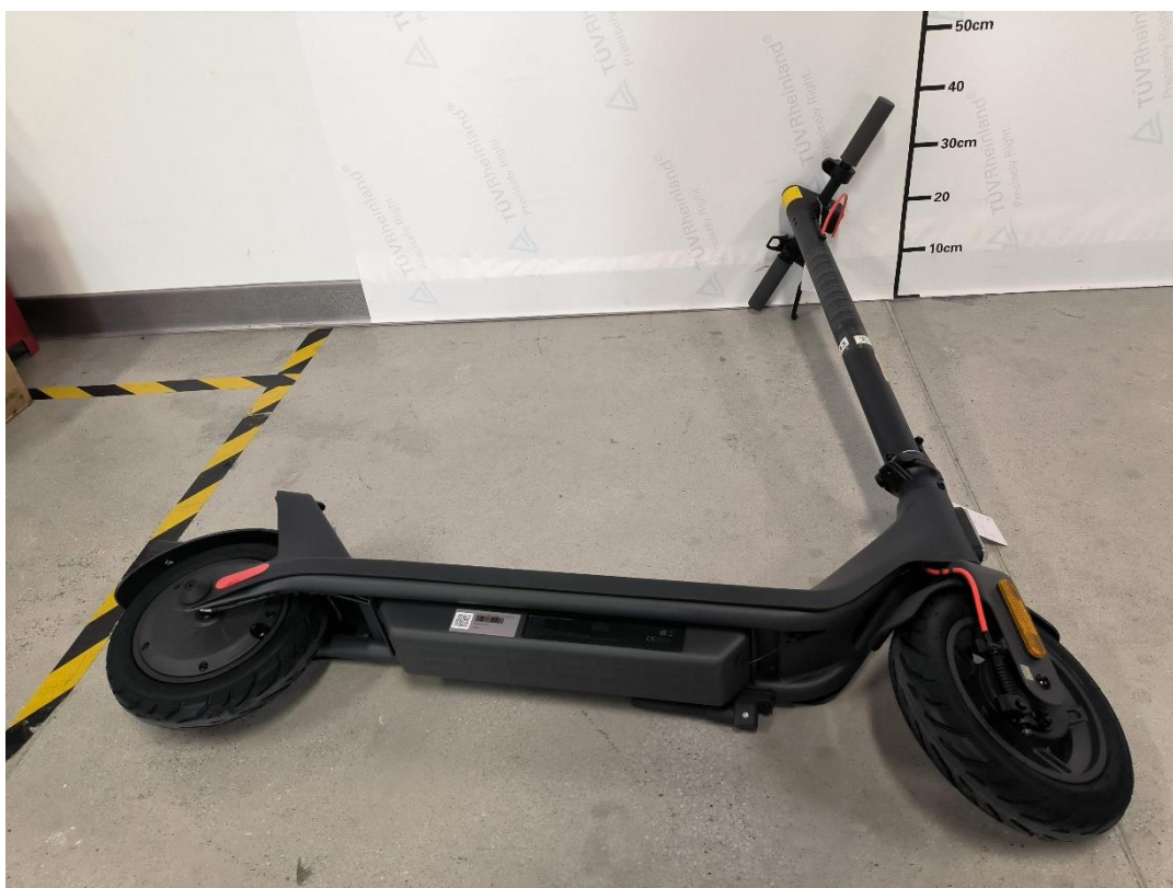
Pic. 6: Overview of DDHBC08LQ