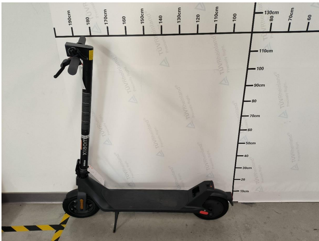
Pic. 3: Overview of DDHBC08LQ