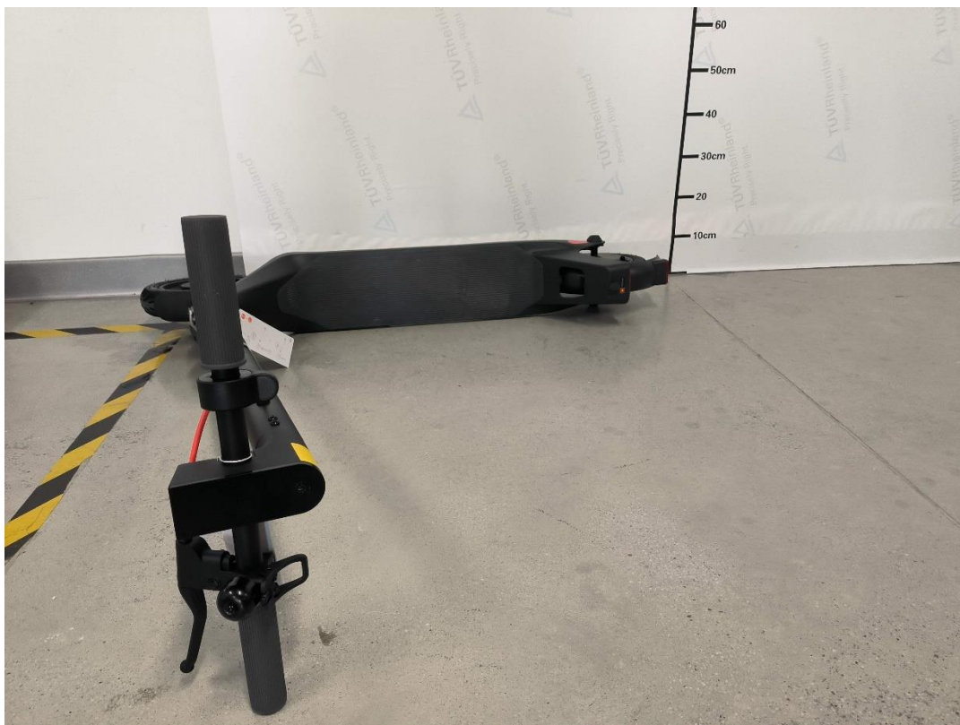
Pic. 5: Overview of DDHBC08LQ