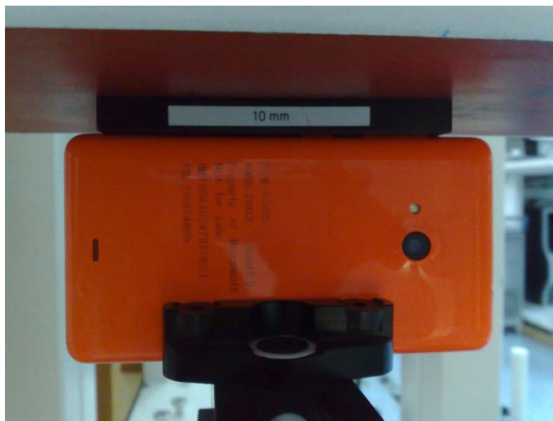
Photo of the device positioned for WR mode measurement – right edge facing phantom. The spacer was removed before the start of the measurements