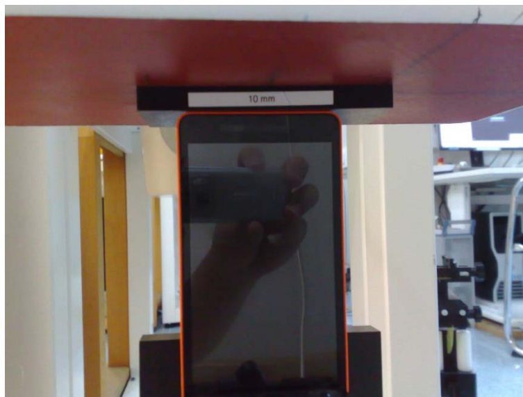
Photo of the device positioned for WR mode measurement – bottom edge facing phantom. The spacer was removed before the start of the measurements.