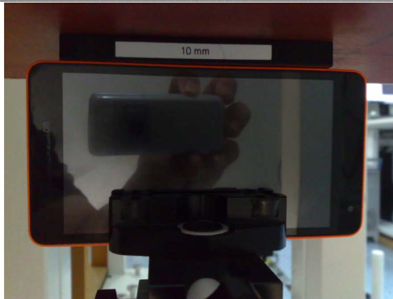
Photo of the device positioned for WR mode measurement – left edge facing phantom. The spacer was removed before the start of the measurements.