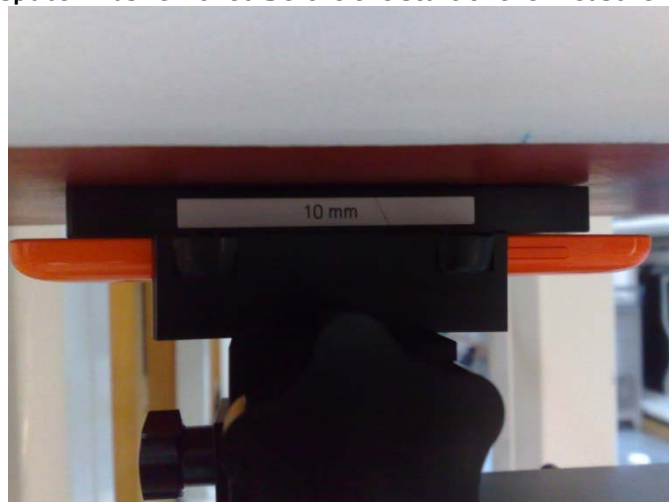
Photo of the device positioned for WR mode measurement – display facing phantom. The spacer was removed before the start of the measurements.