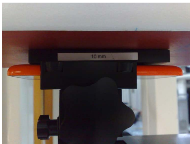
Photo of the device positioned for WR mode measurement –back facing phantom. The spacer was removed before the start of the measurements.

The device was placed in the SPEAG holder and, in sequence, the back, display and each of the 4 edges was positioned 10.0mm away from the flat phantom. The spacer was removed before the start of the measurements.