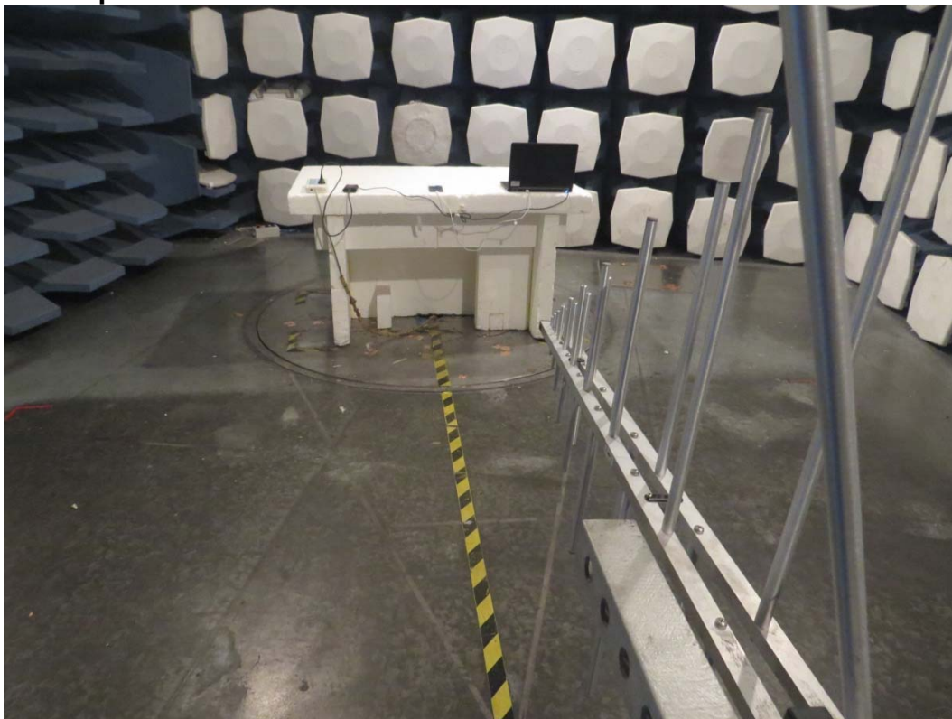
a: Below 1GHz