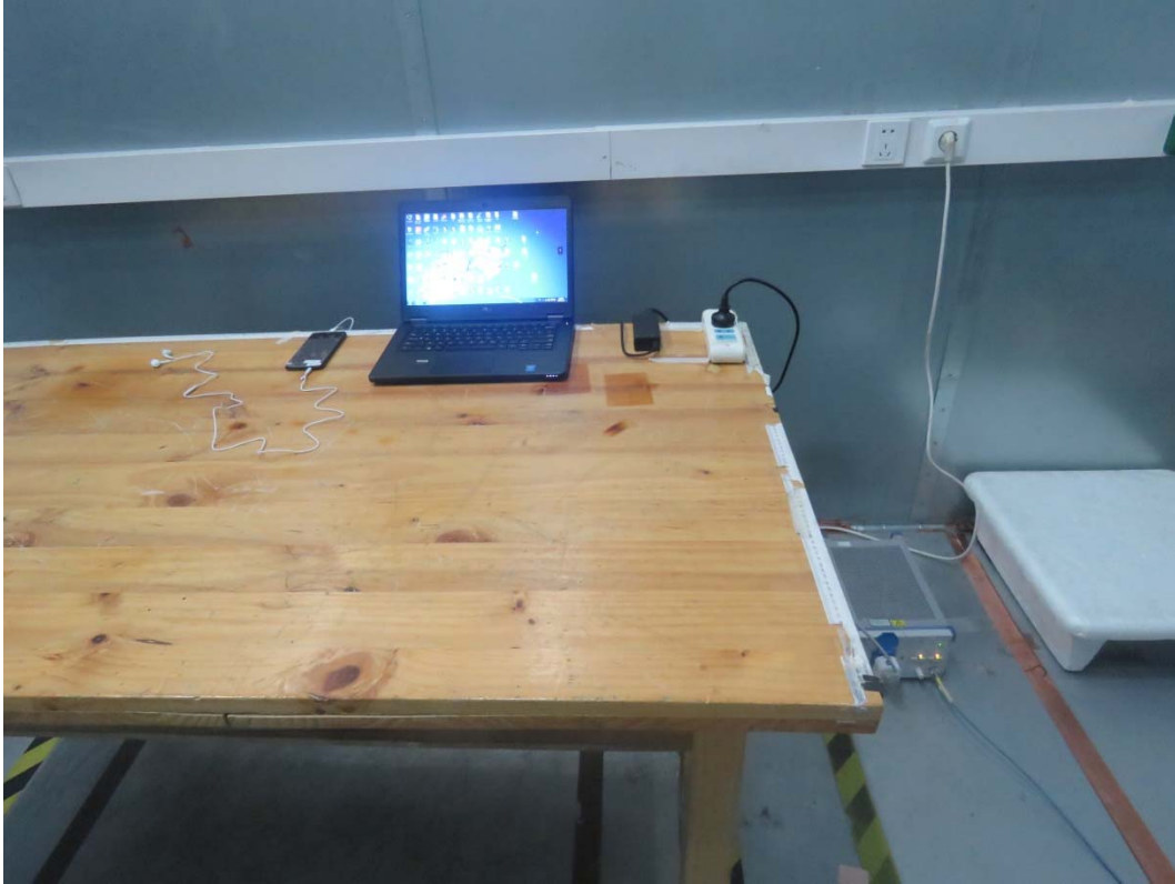
Picture 2 Conducted Emission Test Setup