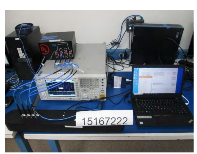
RF ANTENNA PORT CONDUCTED