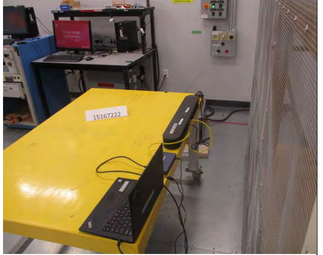
AC LINE CONDUCTED (BACK)