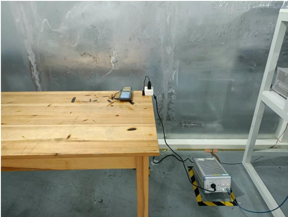
AC Conducted Emission of charge from power adapter mode