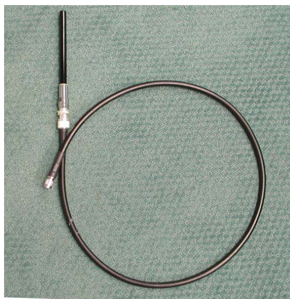
Figure 2. Completed assembly