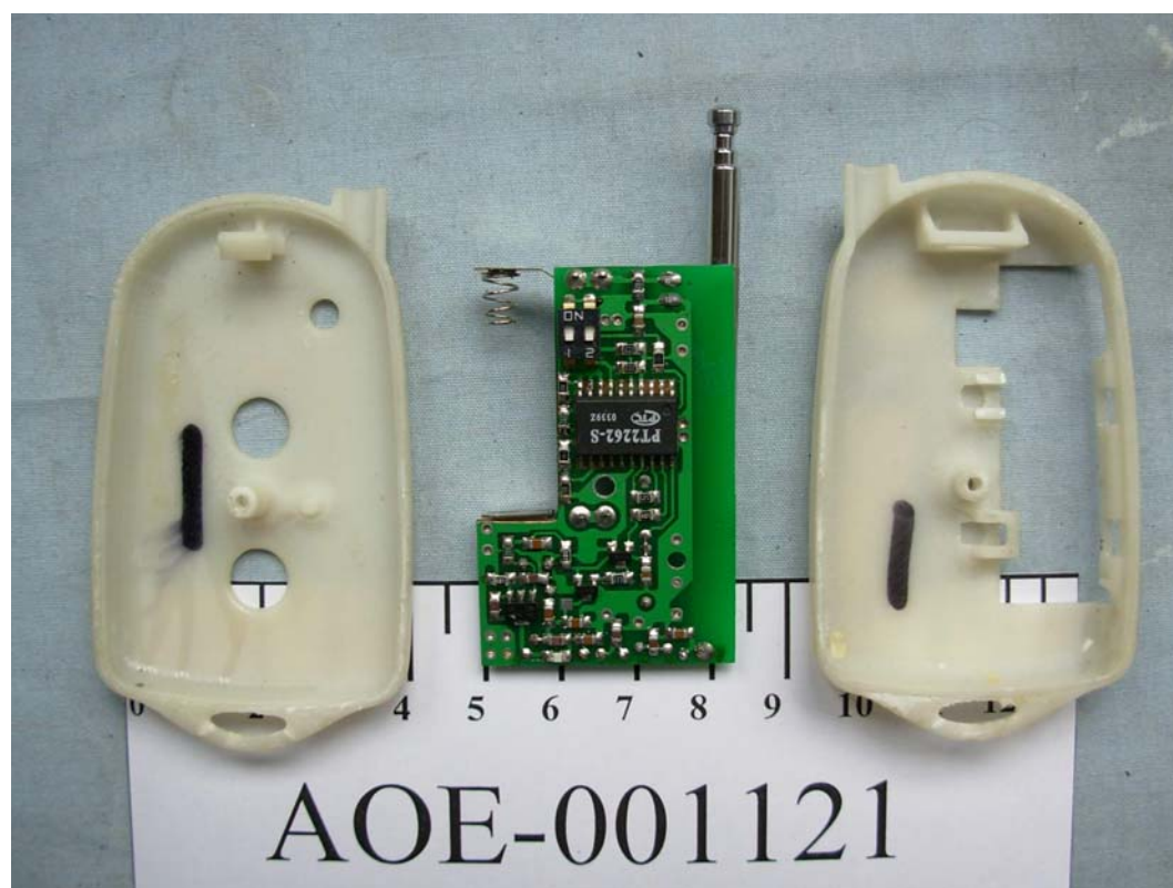
FIGURE 1 REMOTE RAIN (M/N: 5917) COVER REMOVED