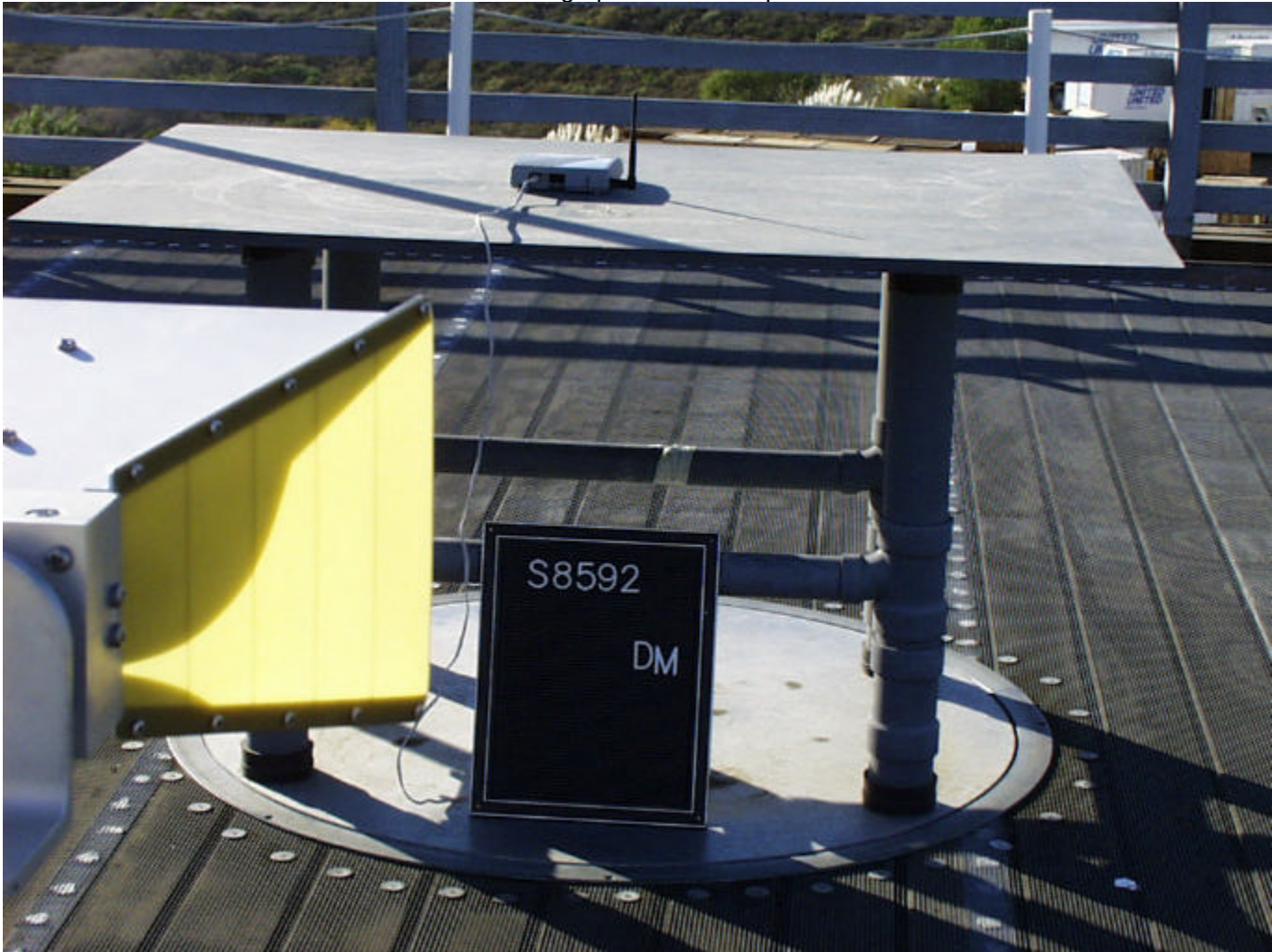
Photograph of Test Setup