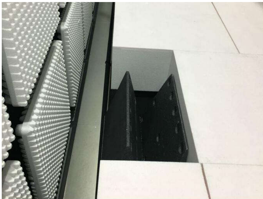
Radiated spurious emission Test Setup-3(Above 1GHz) There are absorbing materials under the ground.