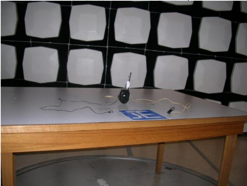
Measurement of Radiated Emission Test Set Up