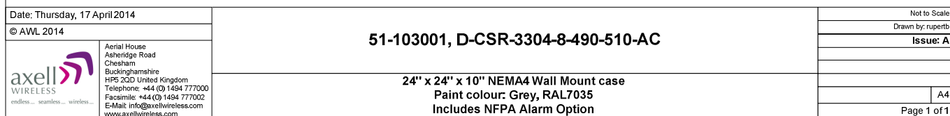
Figure 1. UHF D-CSR3304 for Type approval – Part number 51-103001.