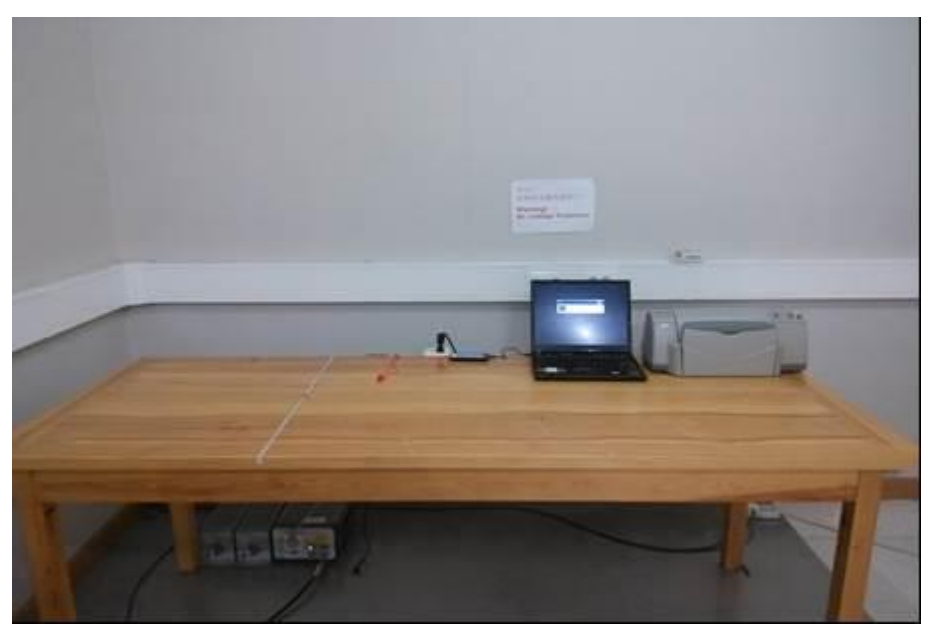
Picture 5. FCC Part 15B AC powerline conducted emissions, computer peripherals, measure from PC charger