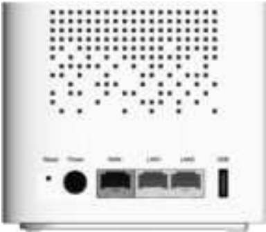
Figure 3-2 The Rear Panel