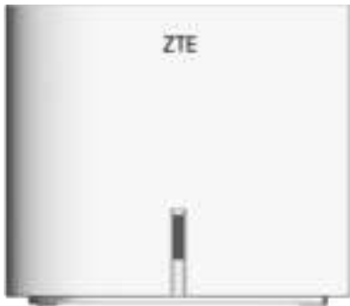
Figure 3-1 The Front Panel