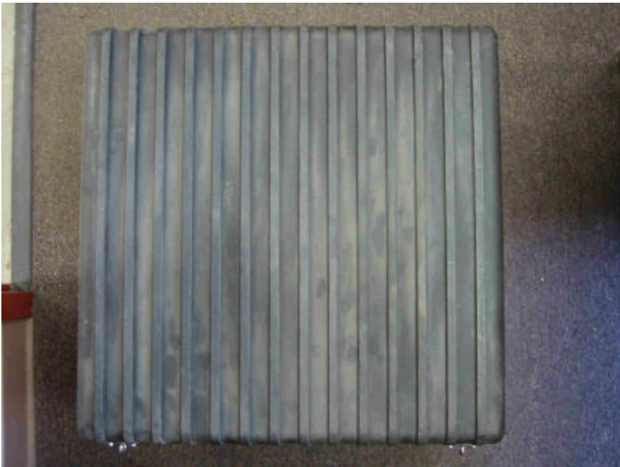
BOTTOM VIEW SHOWING SKID PLATE