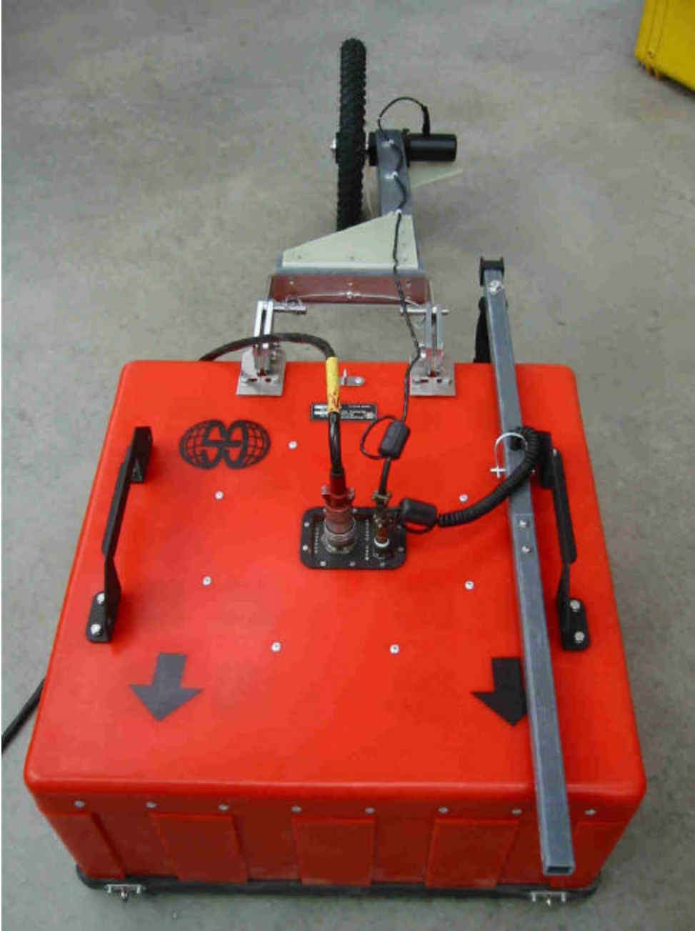
ANTENNA WITH ATTACHMENTS