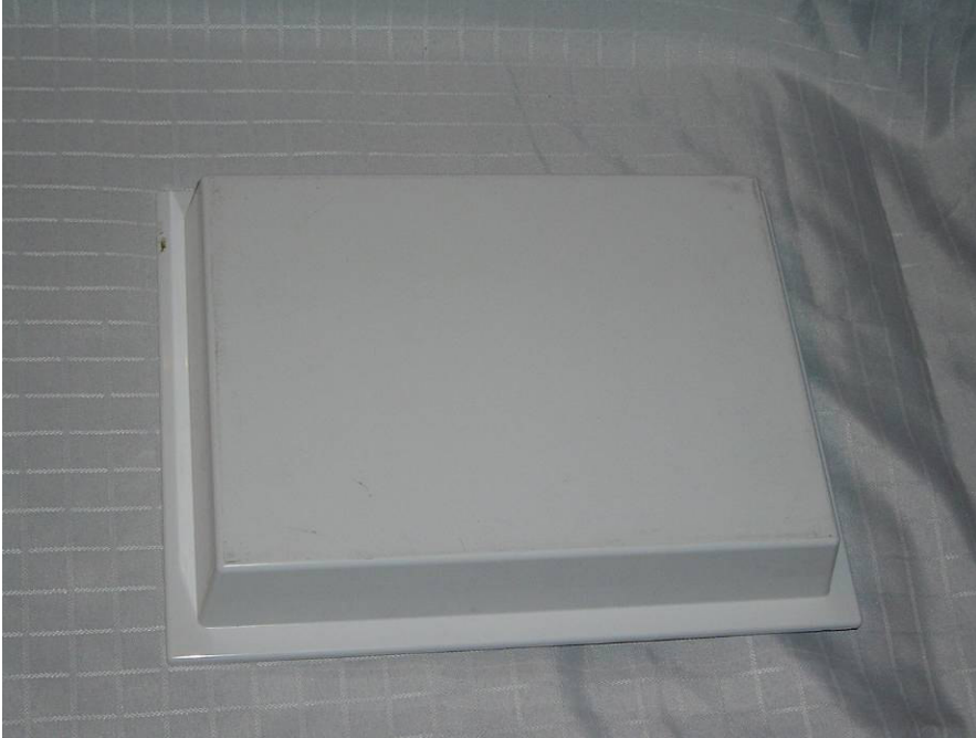
Figure 1 – External, sealed front cover of unit