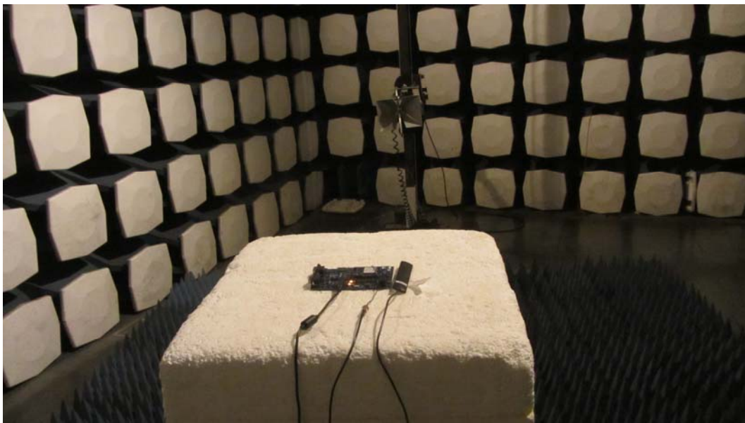
Radiated Spurious Emissions Test setup