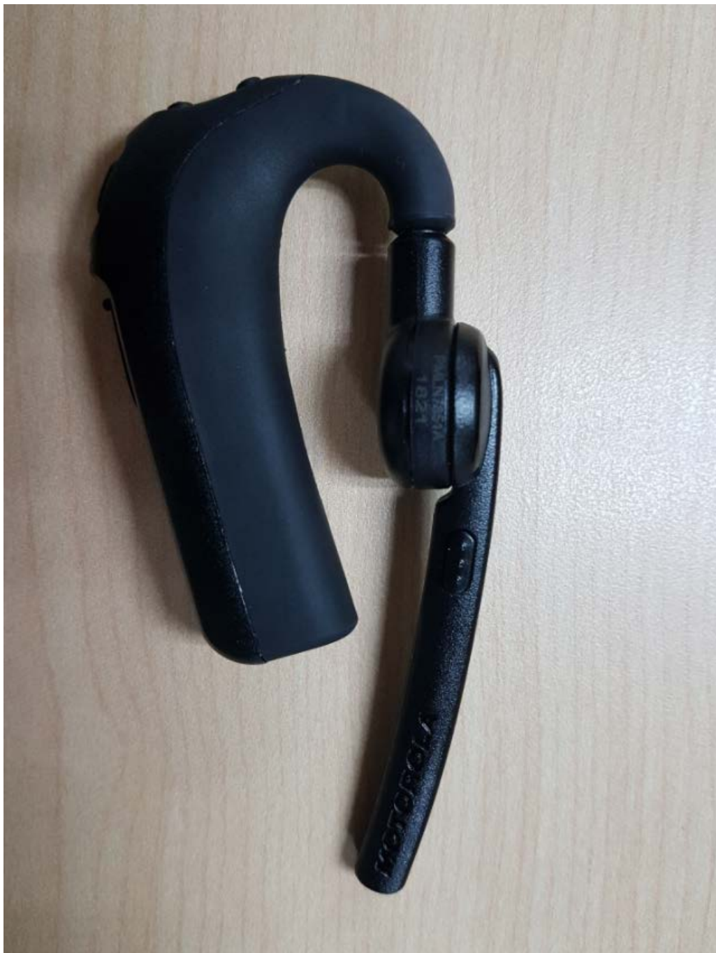
SIDE VIEW WITH BATTERY