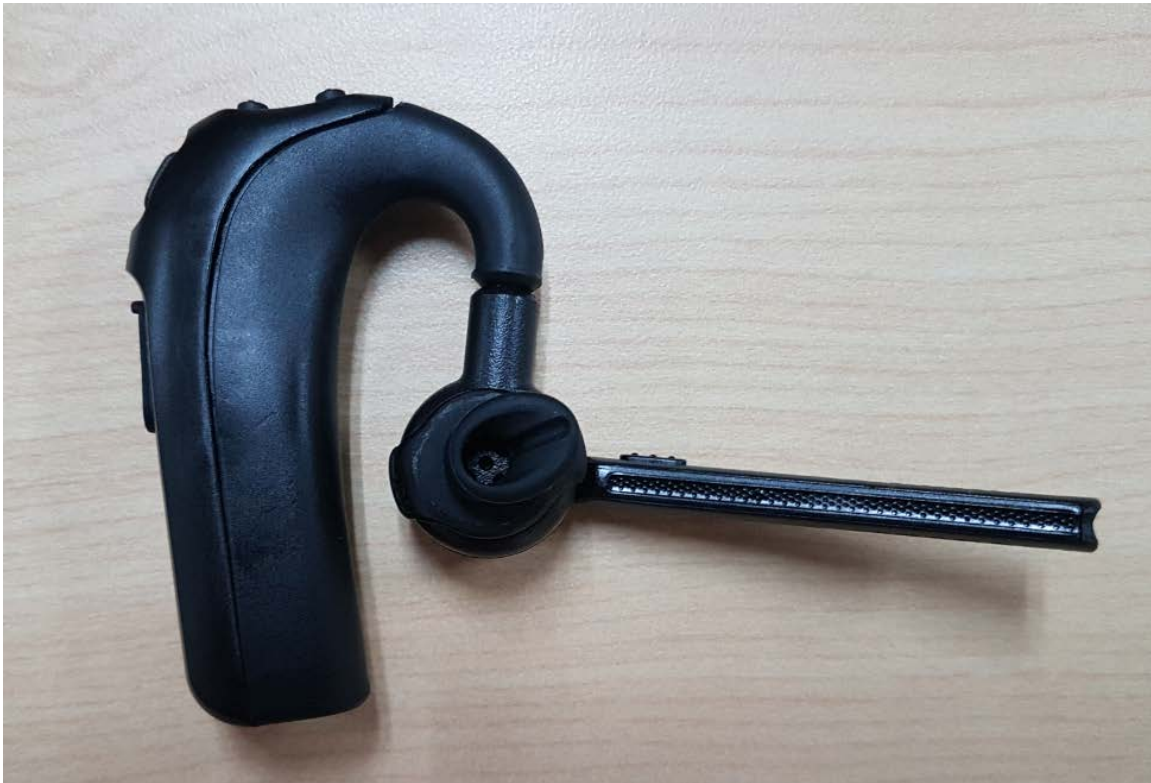
SIDE VIEW (RIGHT)