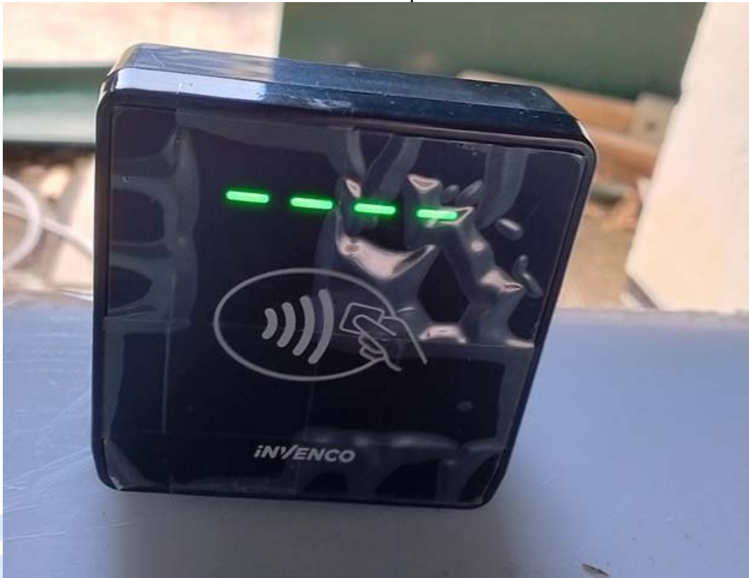
Radiated emissions test setup - Ancillary Device